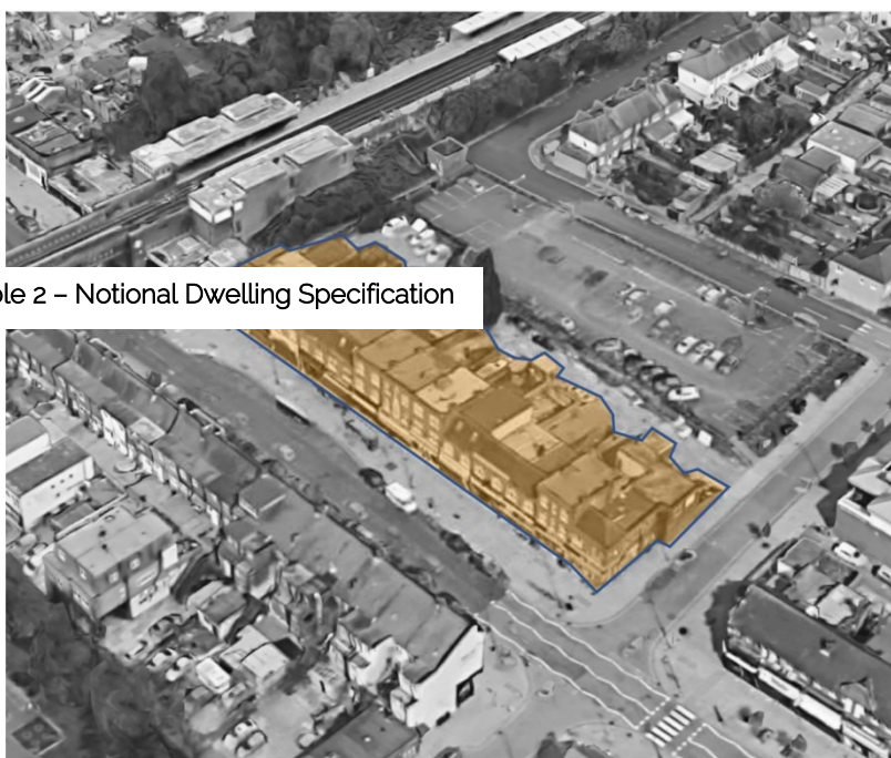
Table 2 – Notional Dwelling Specification