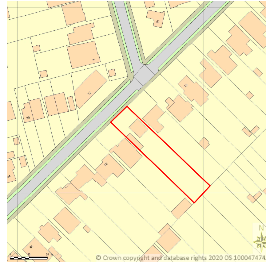
Location Plan@ 1:1250

Single storey Side Extension and Part single and Part Double storey Rear Extension