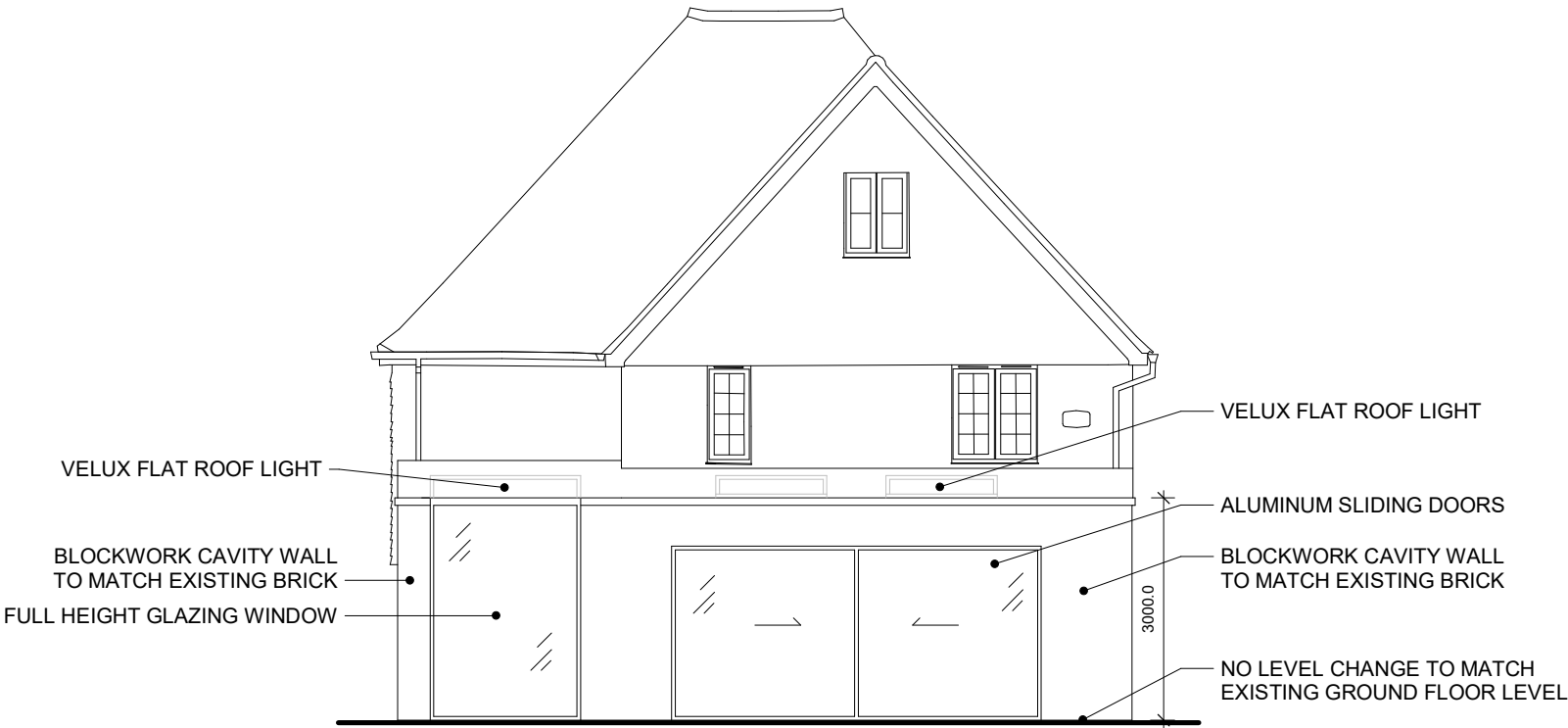
1 PROPOSED REAR ELEVATION 1 : 100