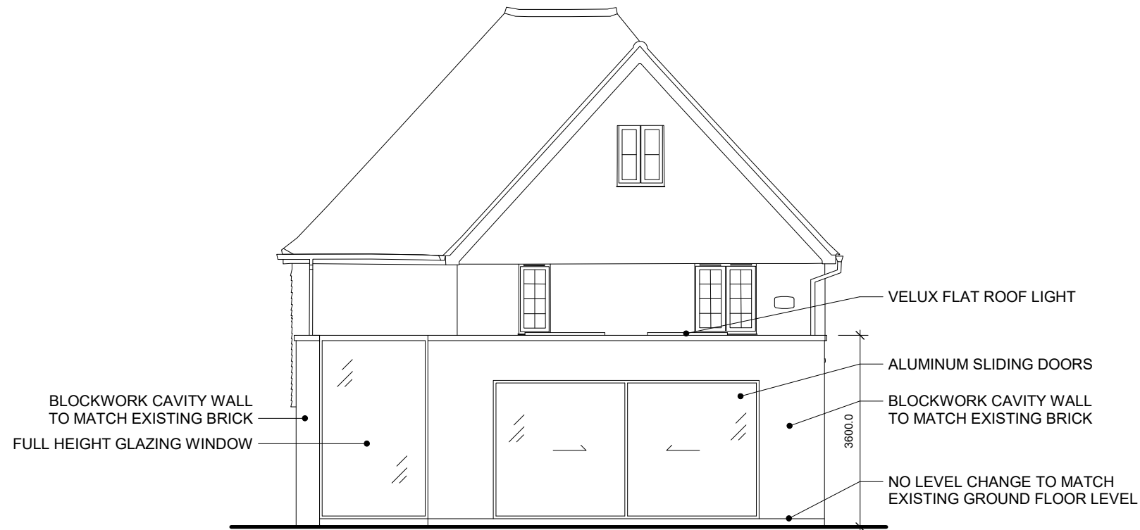
1 PROPOSED REAR ELEVATION 1 : 100