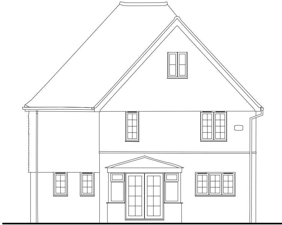
1 EXISTING REAR ELEVATION 1 : 100