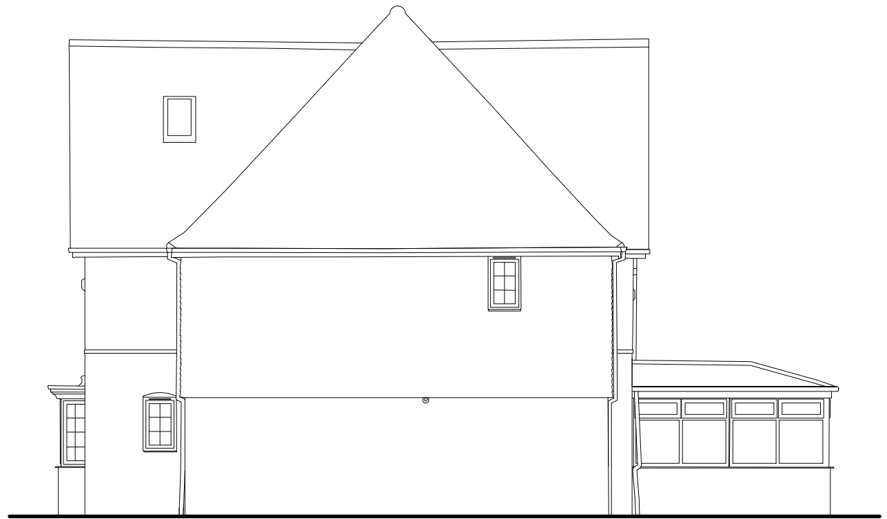
3 EXISTING SOUTH SIDE ELEVATION 1 : 100