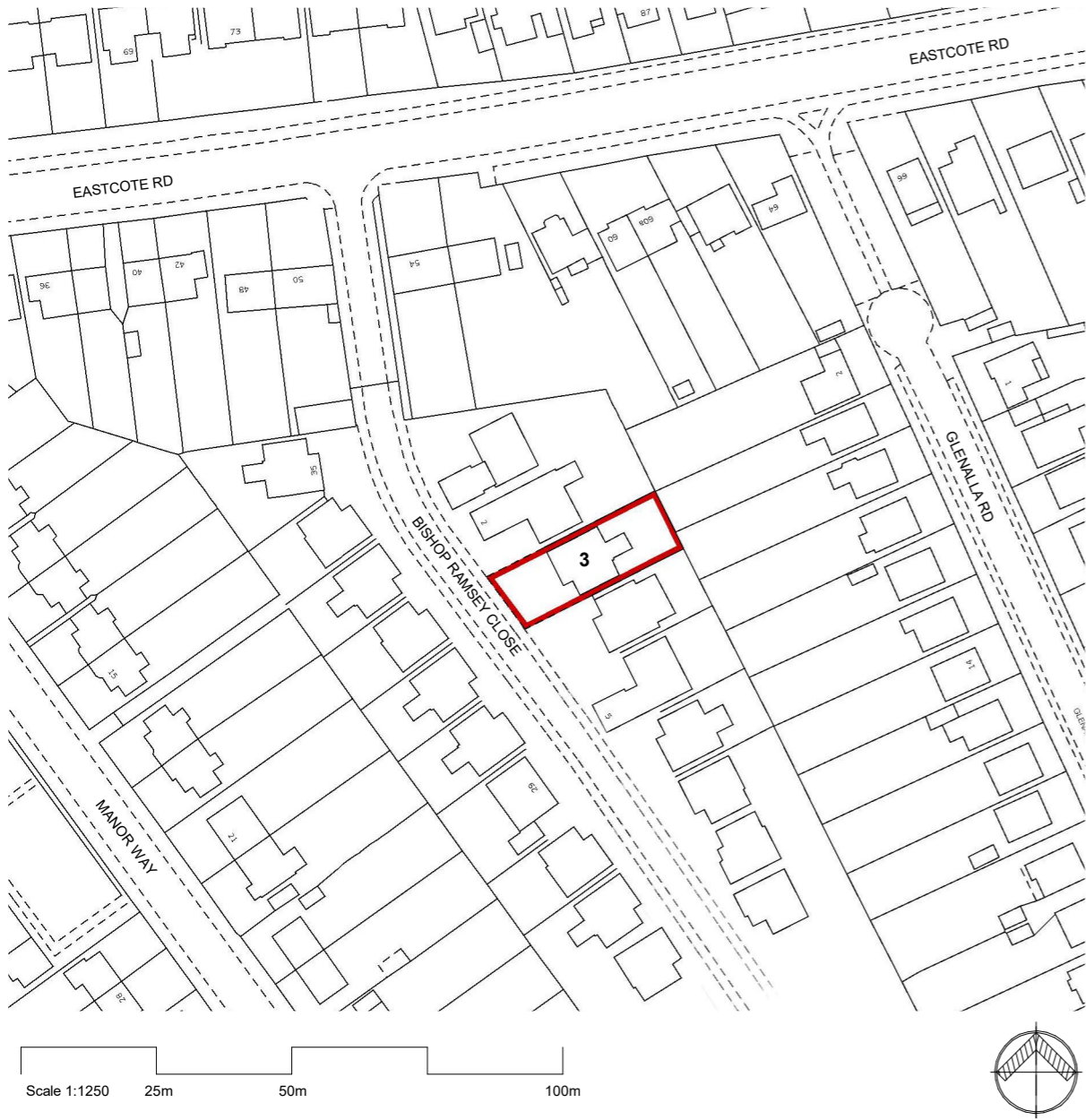
1 Location Plan 1 : 1250