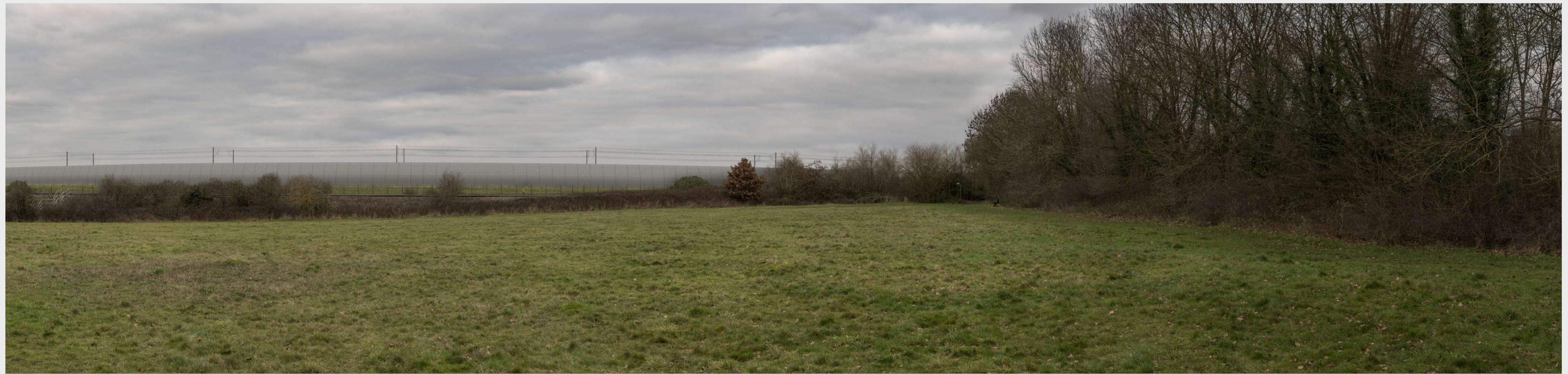
Viewpoint 6: Operation year 15 (2041)- Winter verifiable photomontage