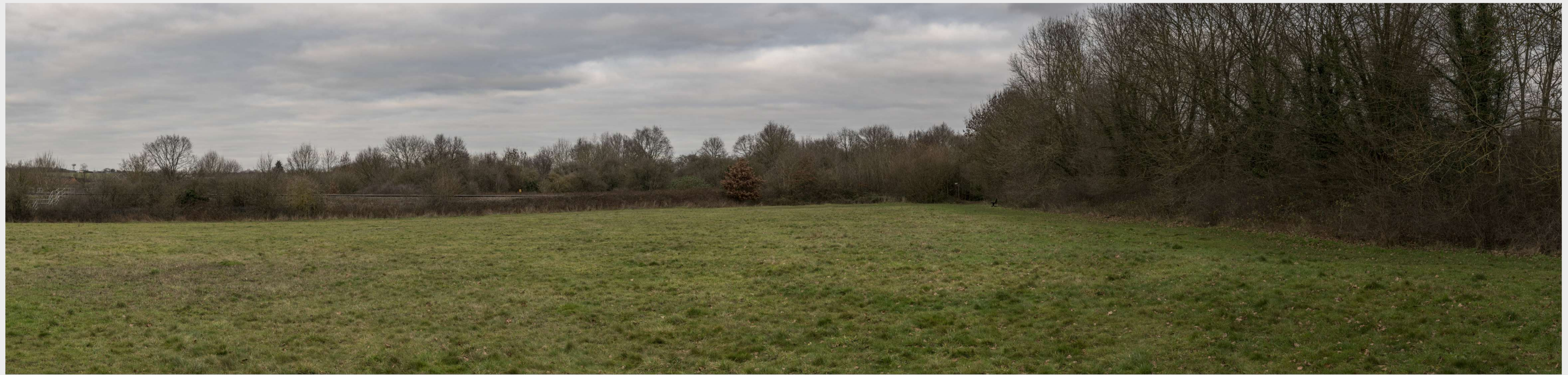
Viewpoint 6: Baseline photography 2019