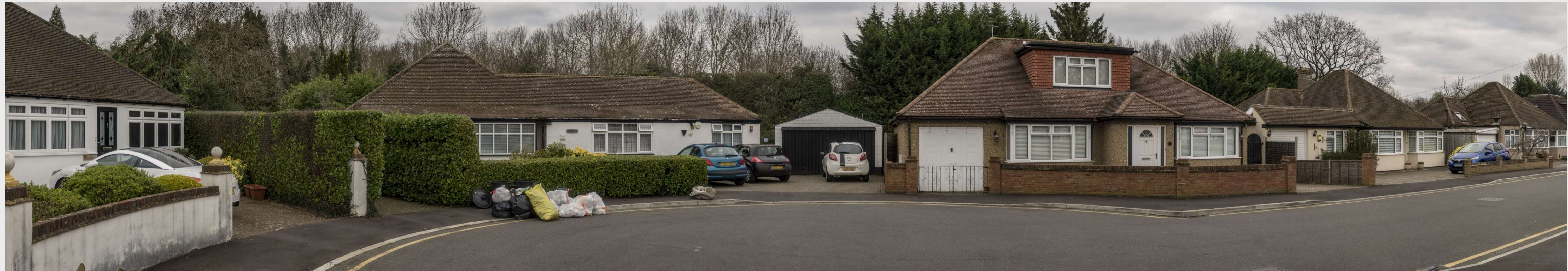
Viewpoint 5: Baseline photography 2019