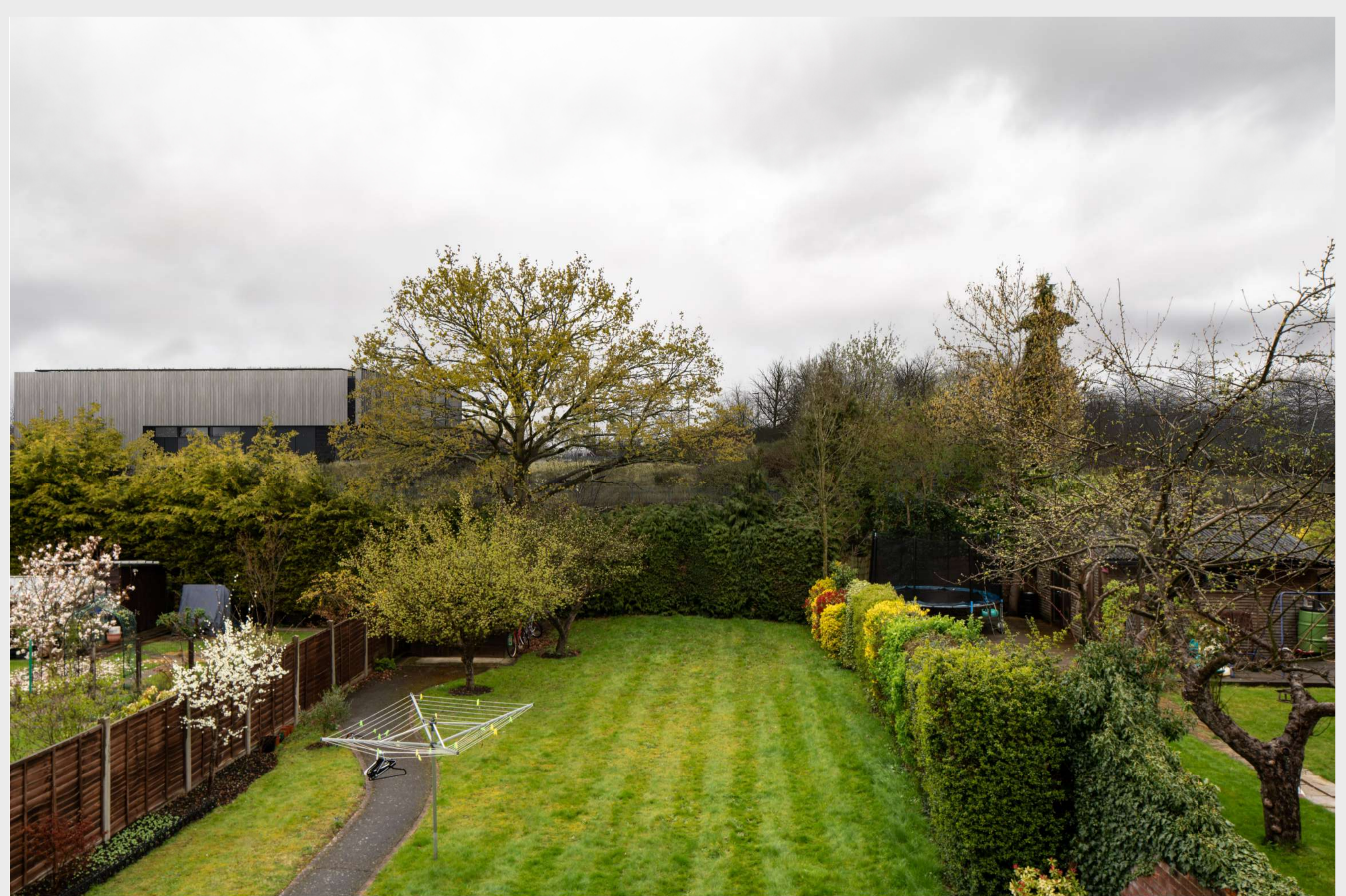
Viewpoint 2: Operation year 15 (2041)- Winter verifiable photomontage