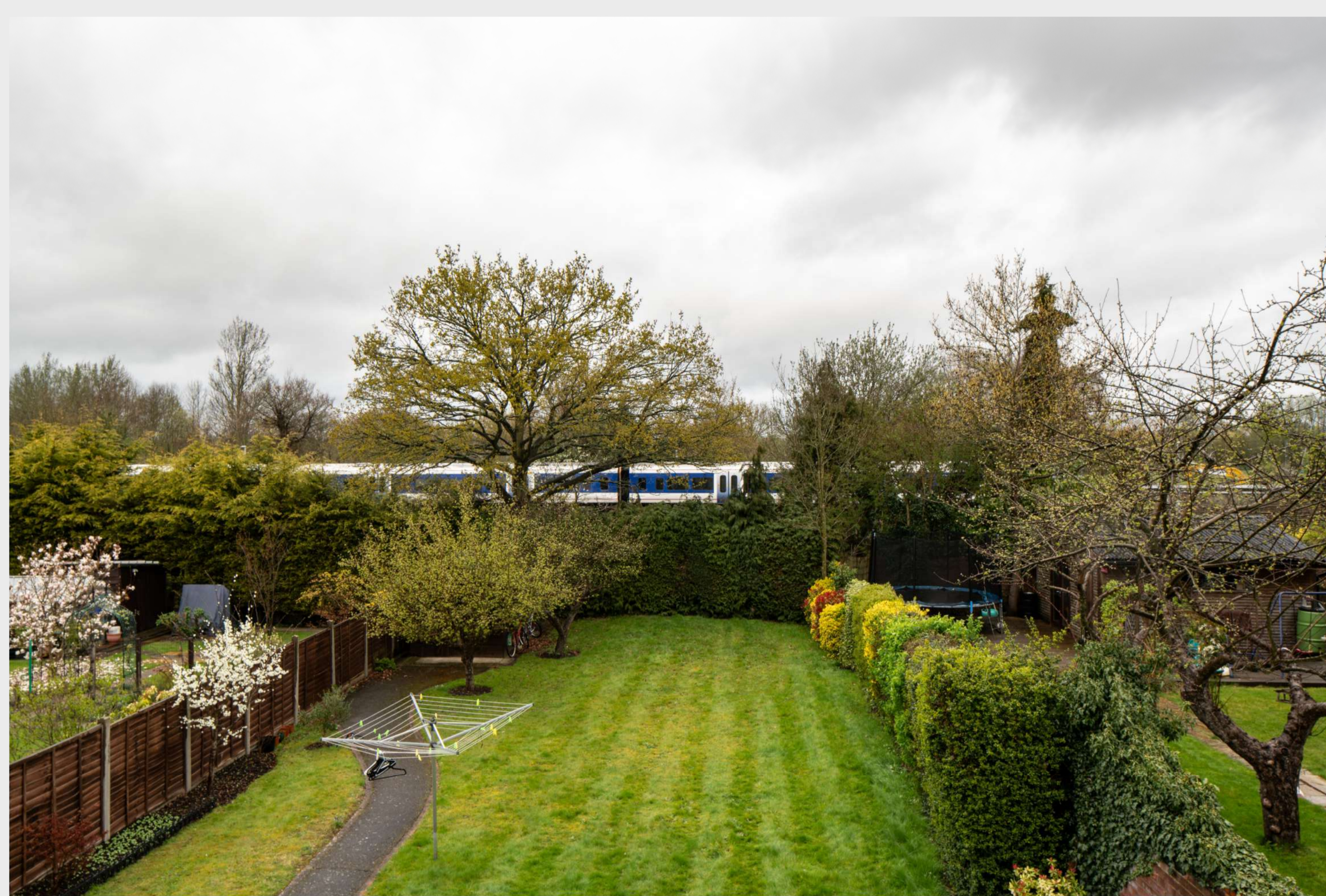
Viewpoint 2: Baseline photography 2019