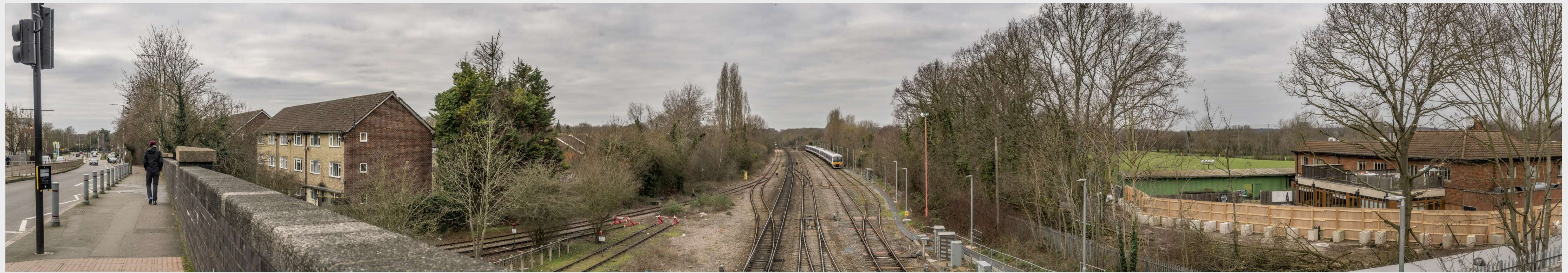
Viewpoint 1: Baseline photography 2019