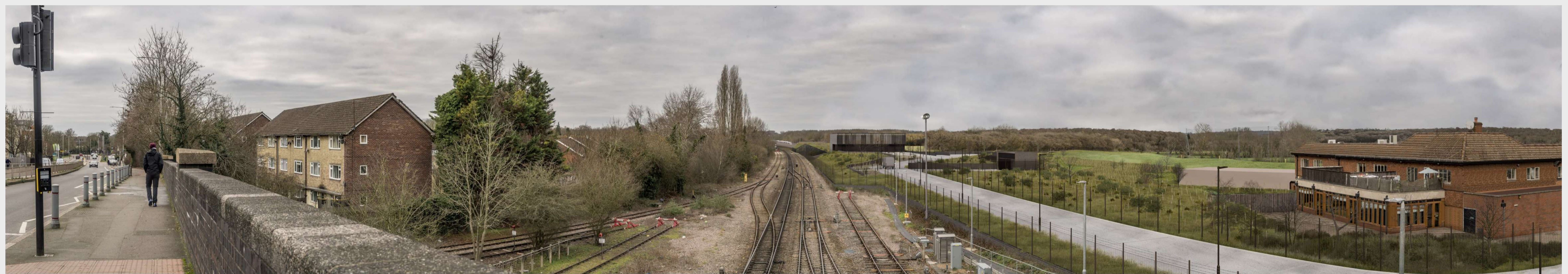
Viewpoint 1: Operation year 1 - Winter verifiable photomontage