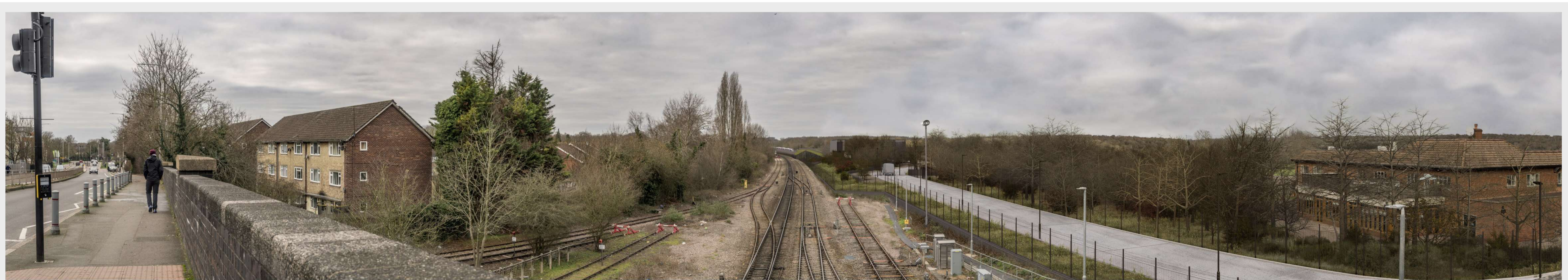
Viewpoint 1: Operation year 15 (2041)- Winter verifiable photomontage