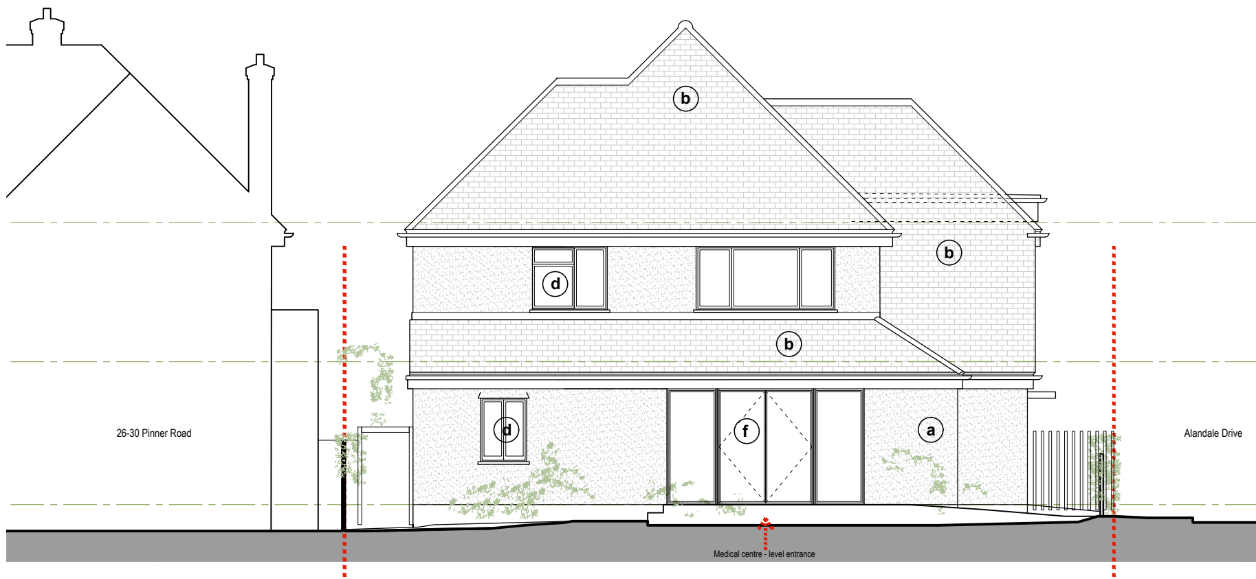
Front Elevation (Pinner Road)