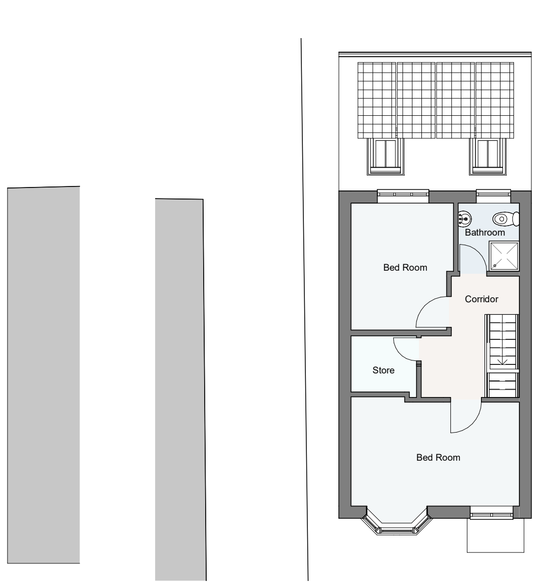
2 Proposed First Floor Plan 2318-VA-200 1 : 100