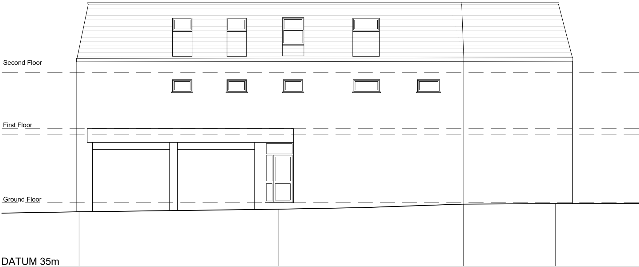
NORTH WEST ELEVATION (Side)