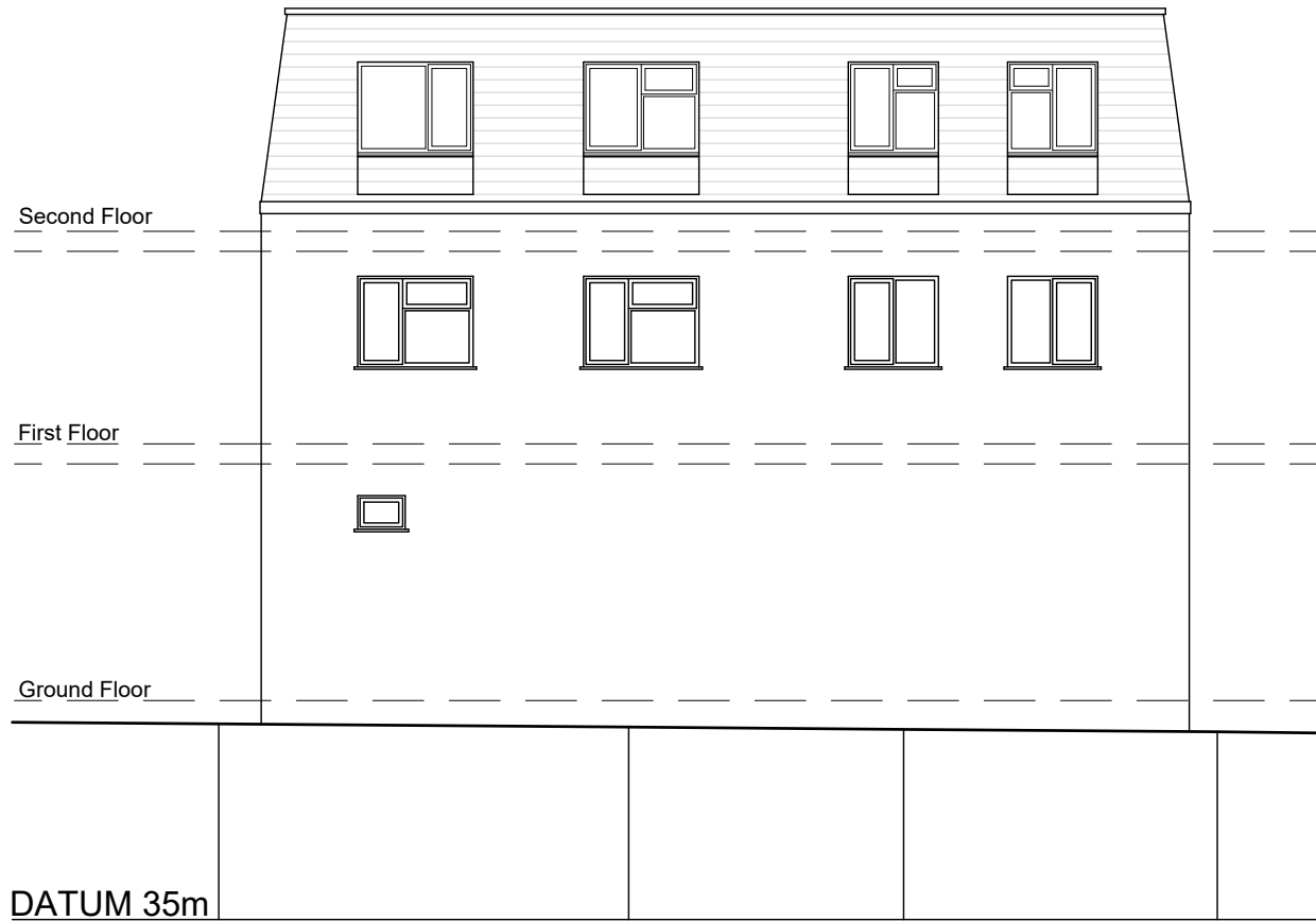
NORTH EAST ELEVATION (Rear)