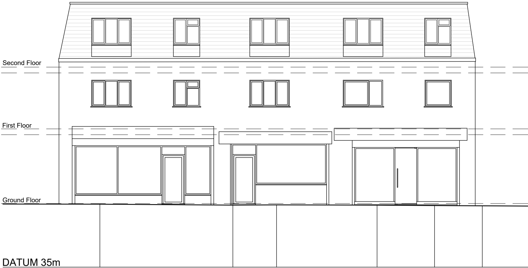
SOUTH WEST ELEVATION (Front)

© This drawing is copyright. It is sent to you in confidence and must not be reproduced or disclosed to third parties without our prior permission. Do not scale from this drawing, other than for Local Authority Planning purposes. This drawing is to be read in conjunction with all relevant consultants, specialist manufacturers drawings and specifications. Any discrepancies in dimensions or details on or between these drawings should be drawn to our attention. All dimensions are in millimetres unless noted otherwise.