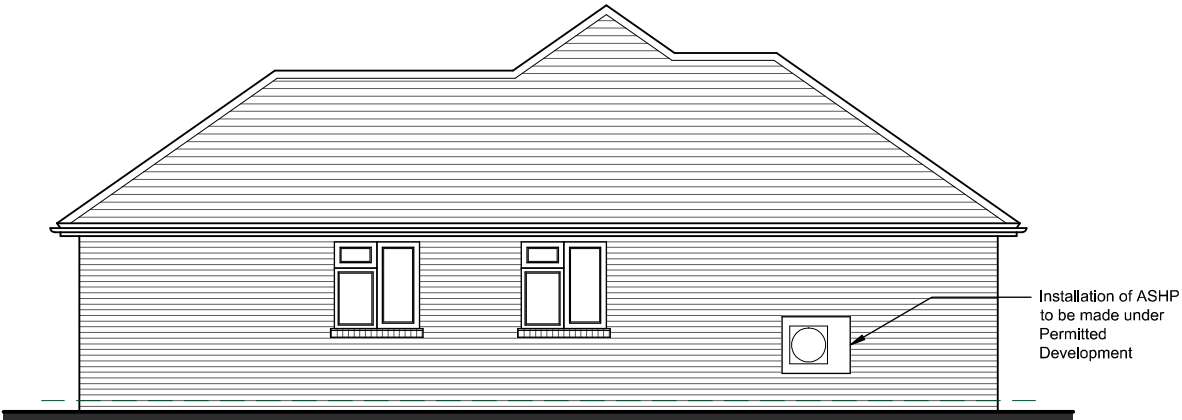
Side Elevation (facing no. 2 Grove Road) Scale - 1:100