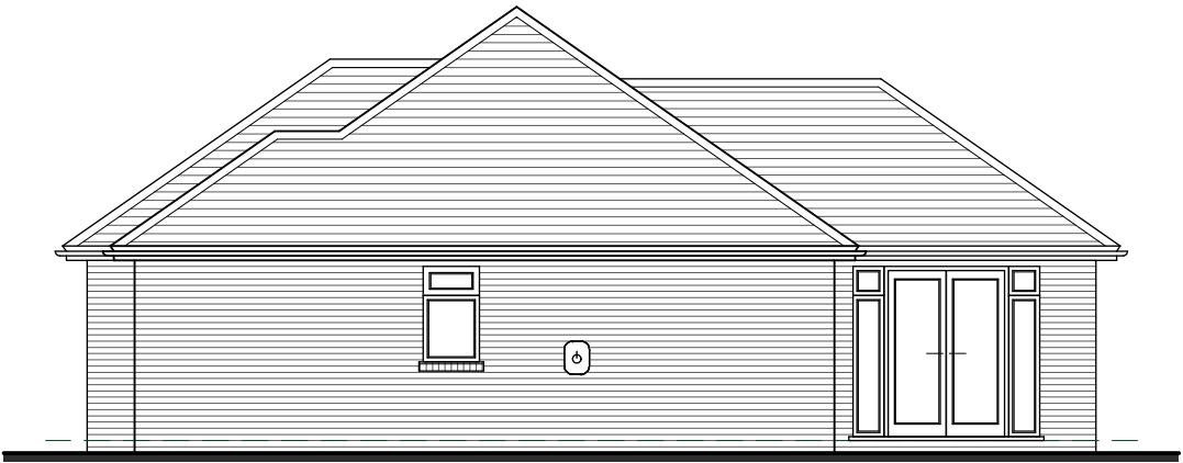
Side Elevation (facing no. 18 Moor Park Road) Scale - 1:100