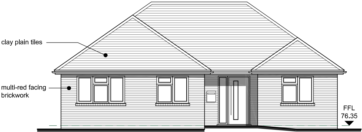
Front Elevation Scale - 1:100