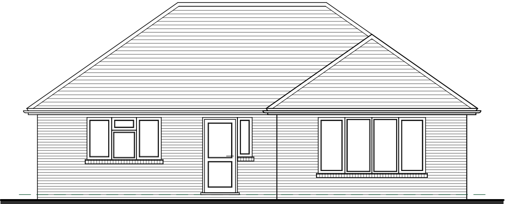
Rear Elevation Scale - 1:100