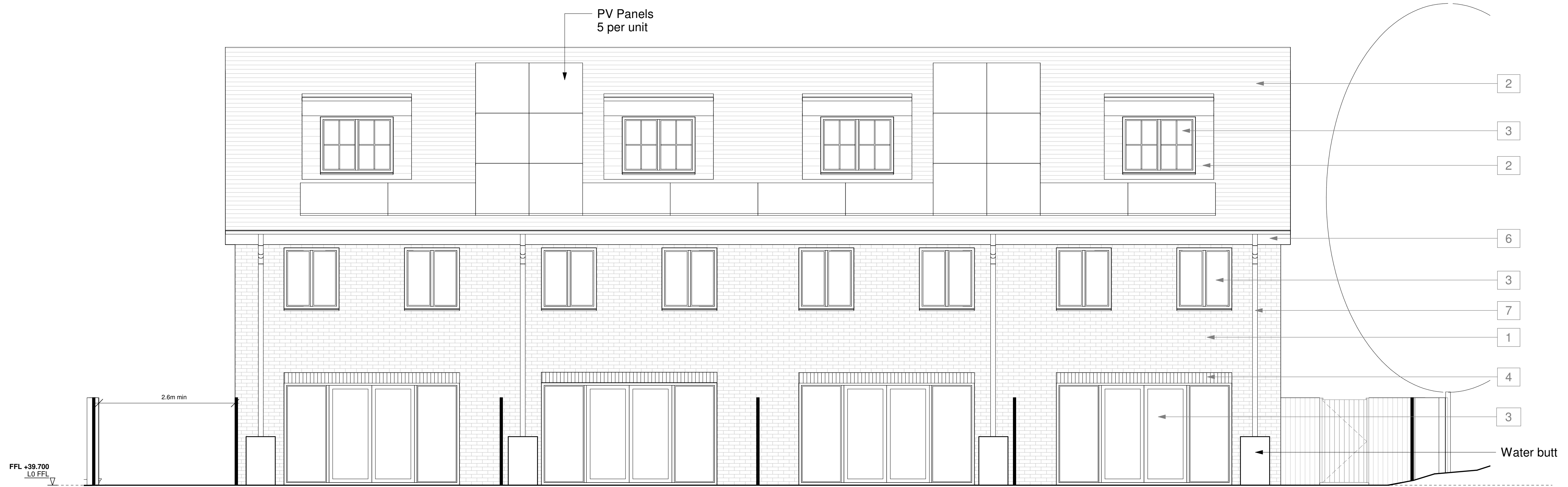
1 SOUTH EAST ELEVATION 1 : 50