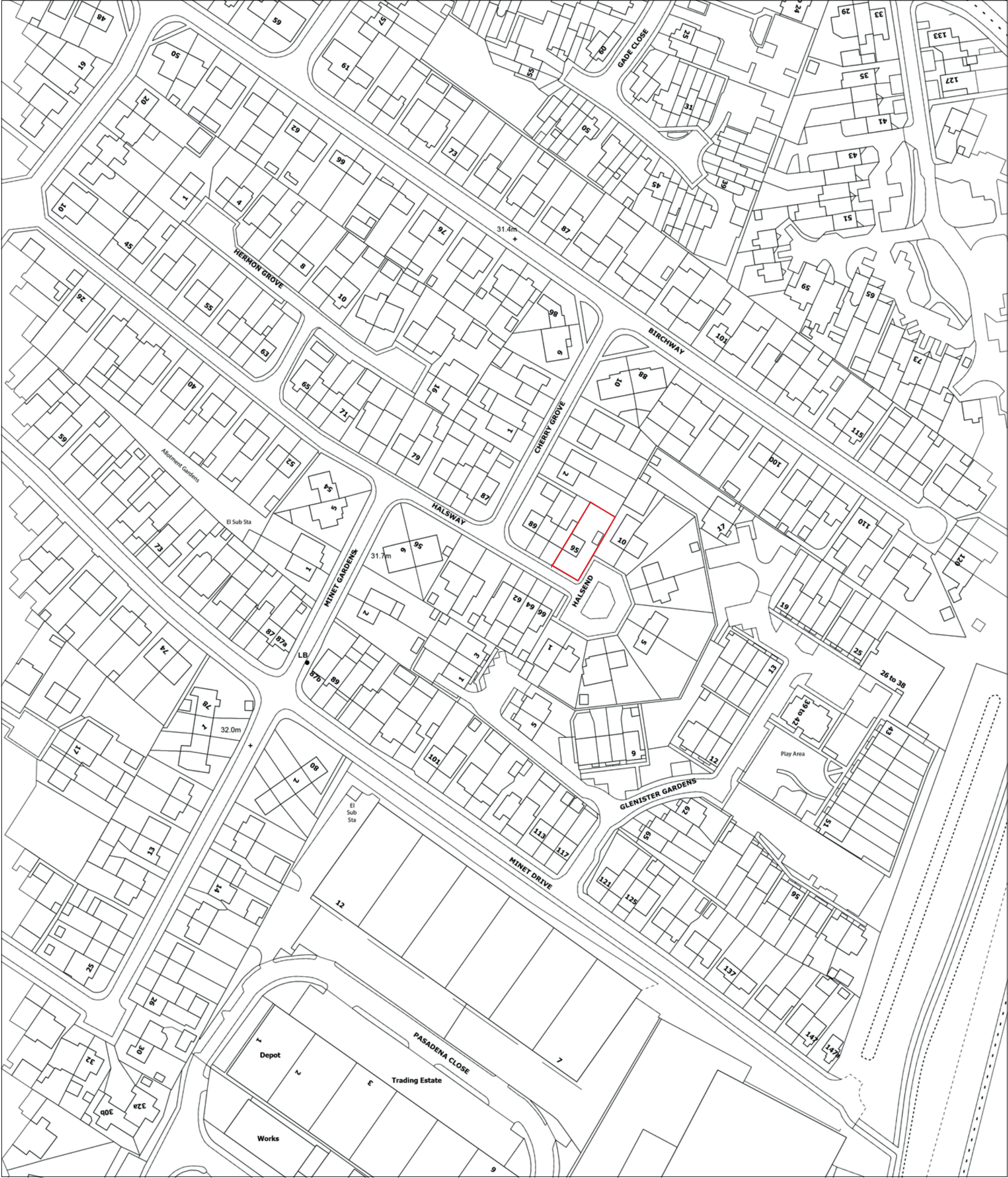
SITE LOCATION PLAN SCALE 1:1250 SITE BOUNDRY :