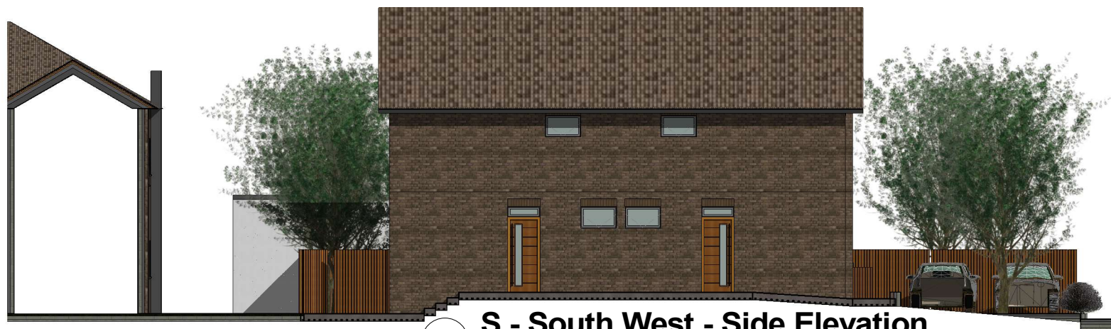
2 S - South West - Side Elevation 1 : 100