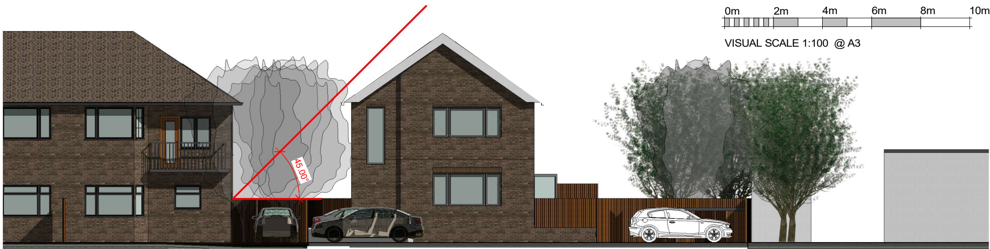
1 S - South East Elevation - Front 1 : 100