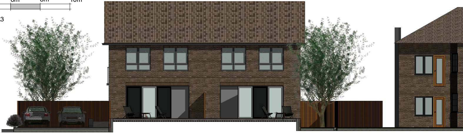
1 S - North East - Side Elevation 1 : 100