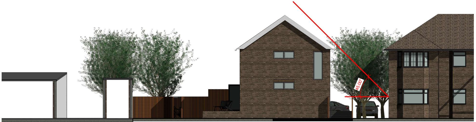
2 S - North West - Rear 1 : 100