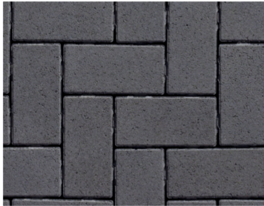
Permeable Block Paving

Permeable block paving to be used in areas of hardstanding to prevent surface water flooding