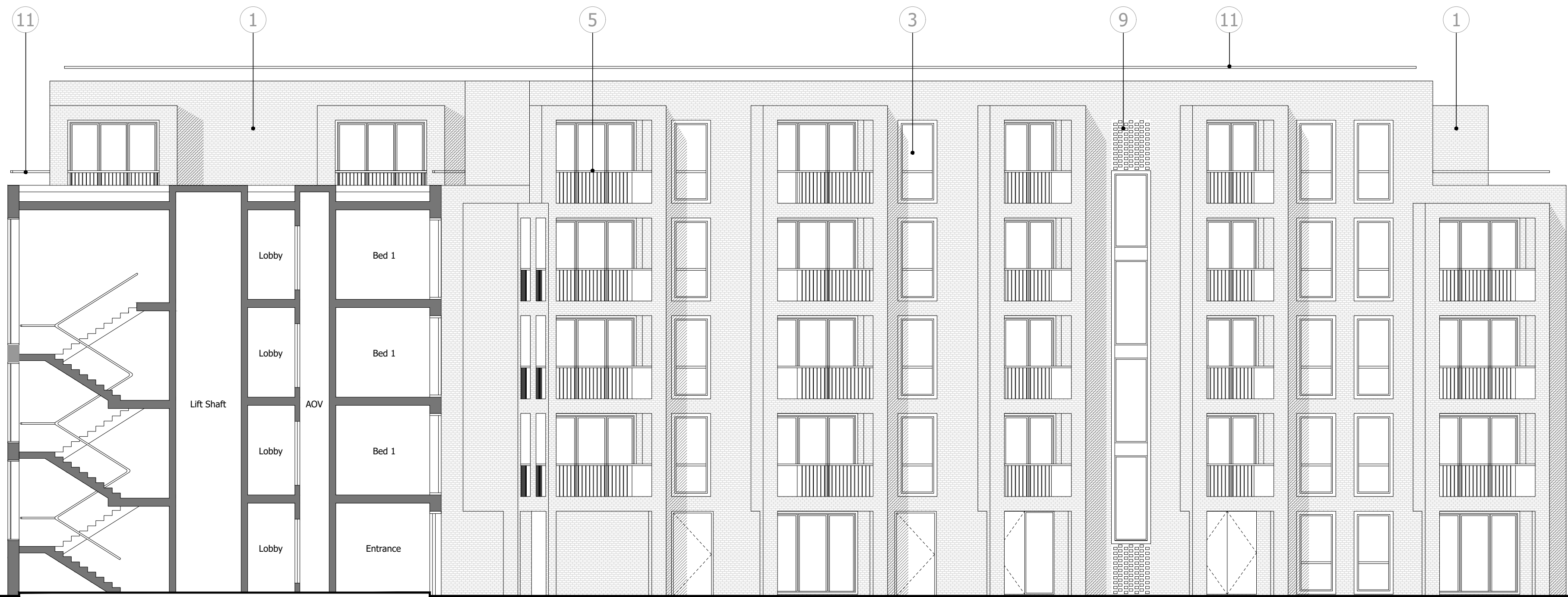
01 Section A Scale 1:100