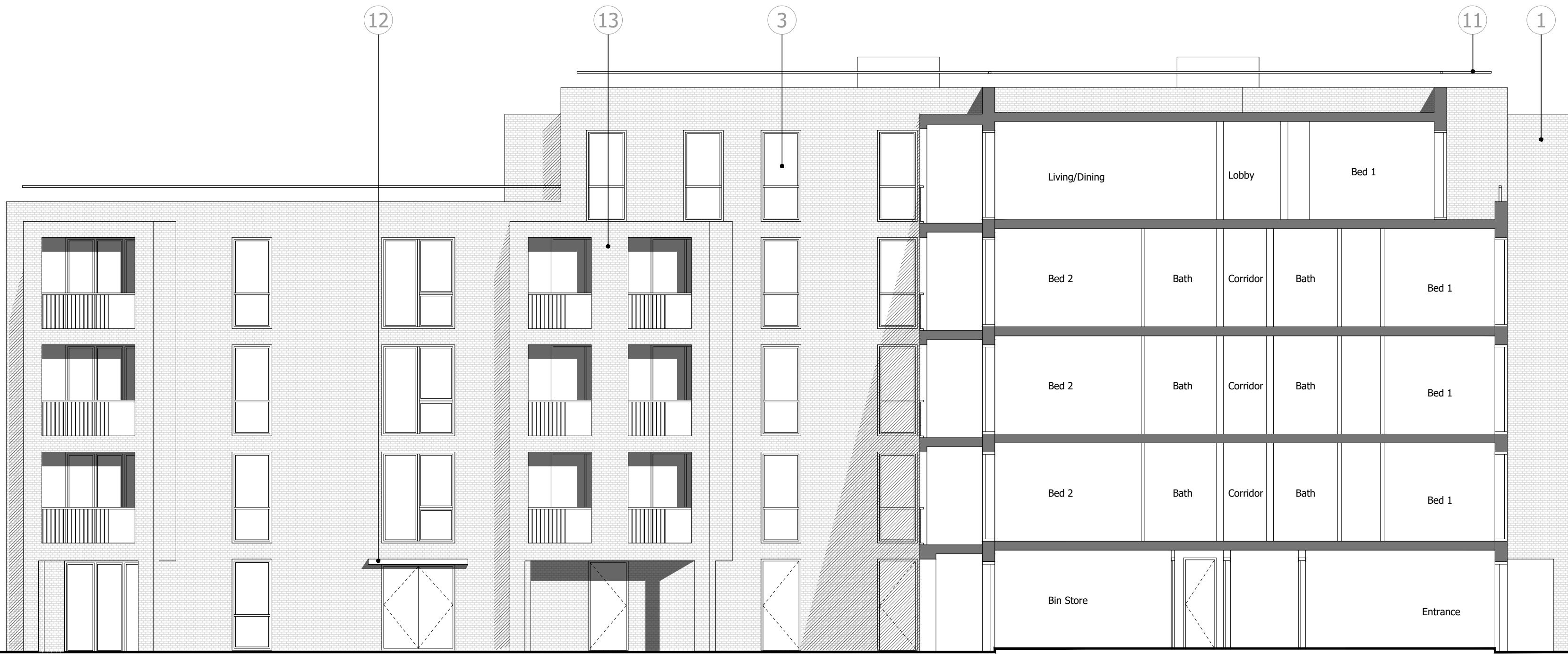
02 Section B Scale 1:100