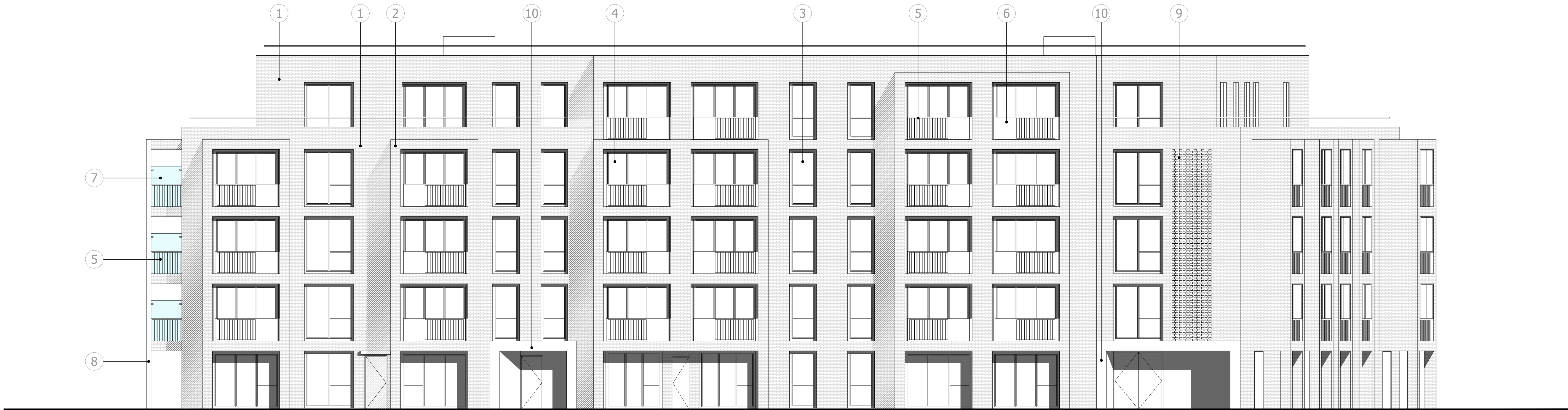
01 Elevation A: South Elevation Scale 1:100