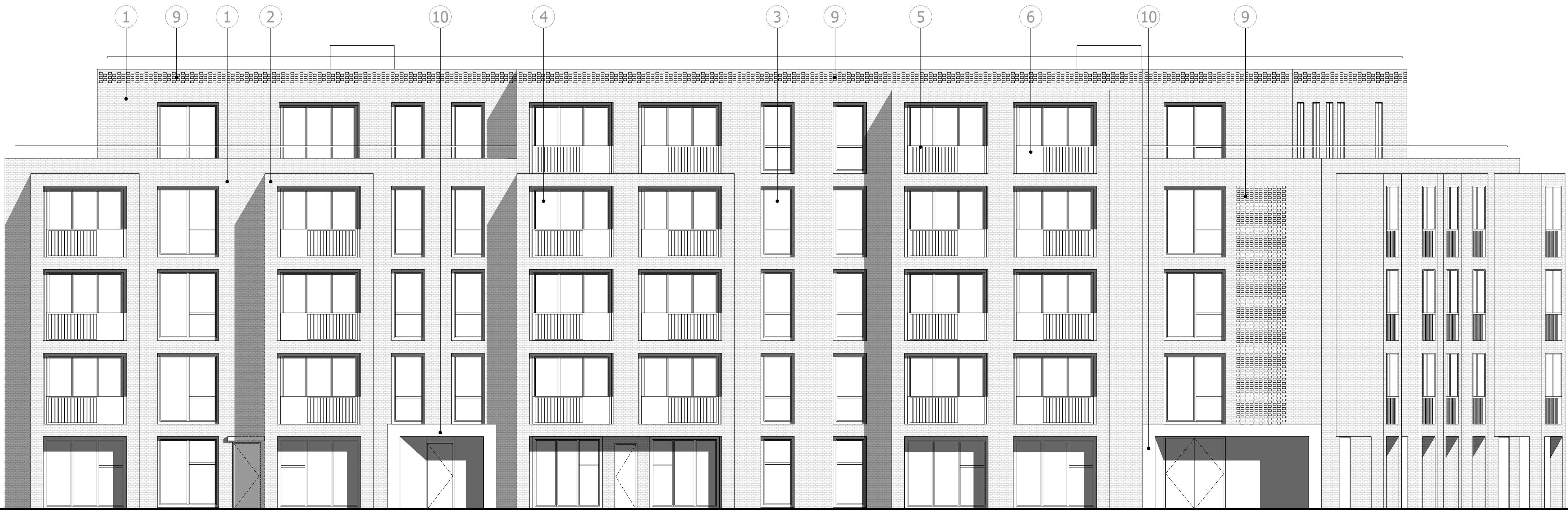
01 Elevation A: South Elevation Scale 1:100