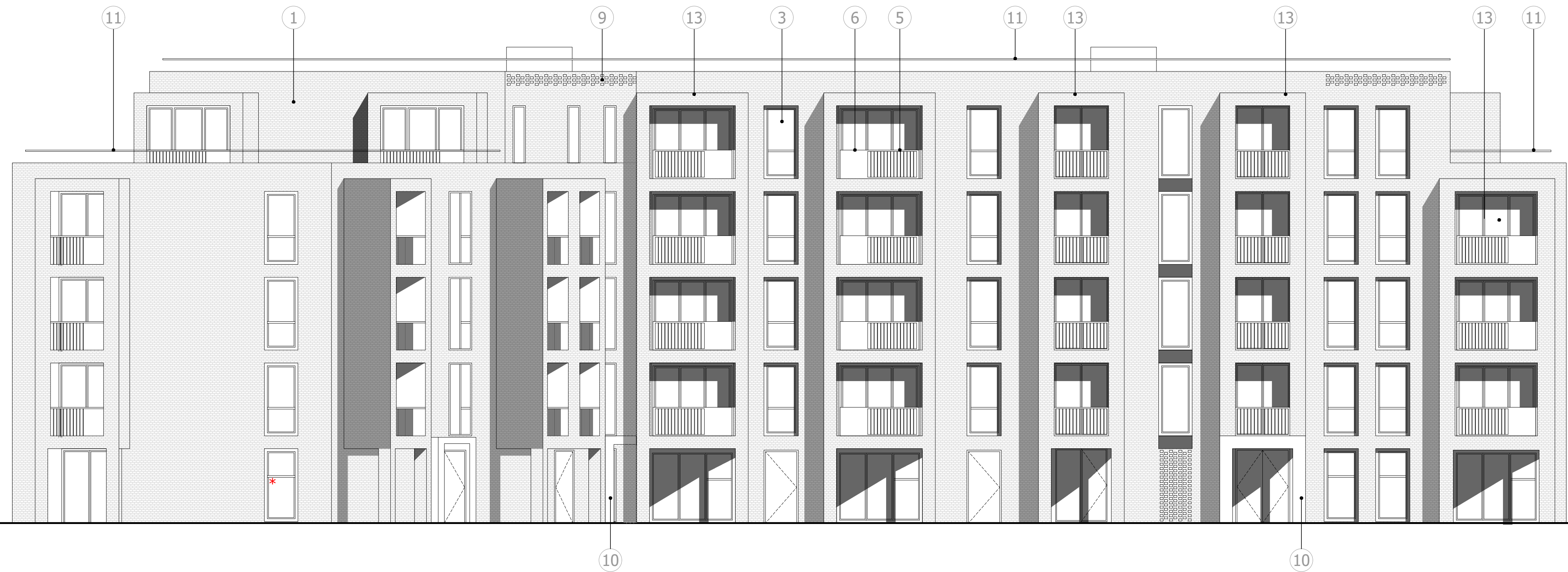
02 Elevation B: North Elevation Scale 1:100

E-mail: admin@oselarch.co.uk Web: www.oselarchitecture.co.uk ©COPYRIGHT EXISTS ON THE DESIGNS AND INFORMATION SHOWN ON THIS DRAWING