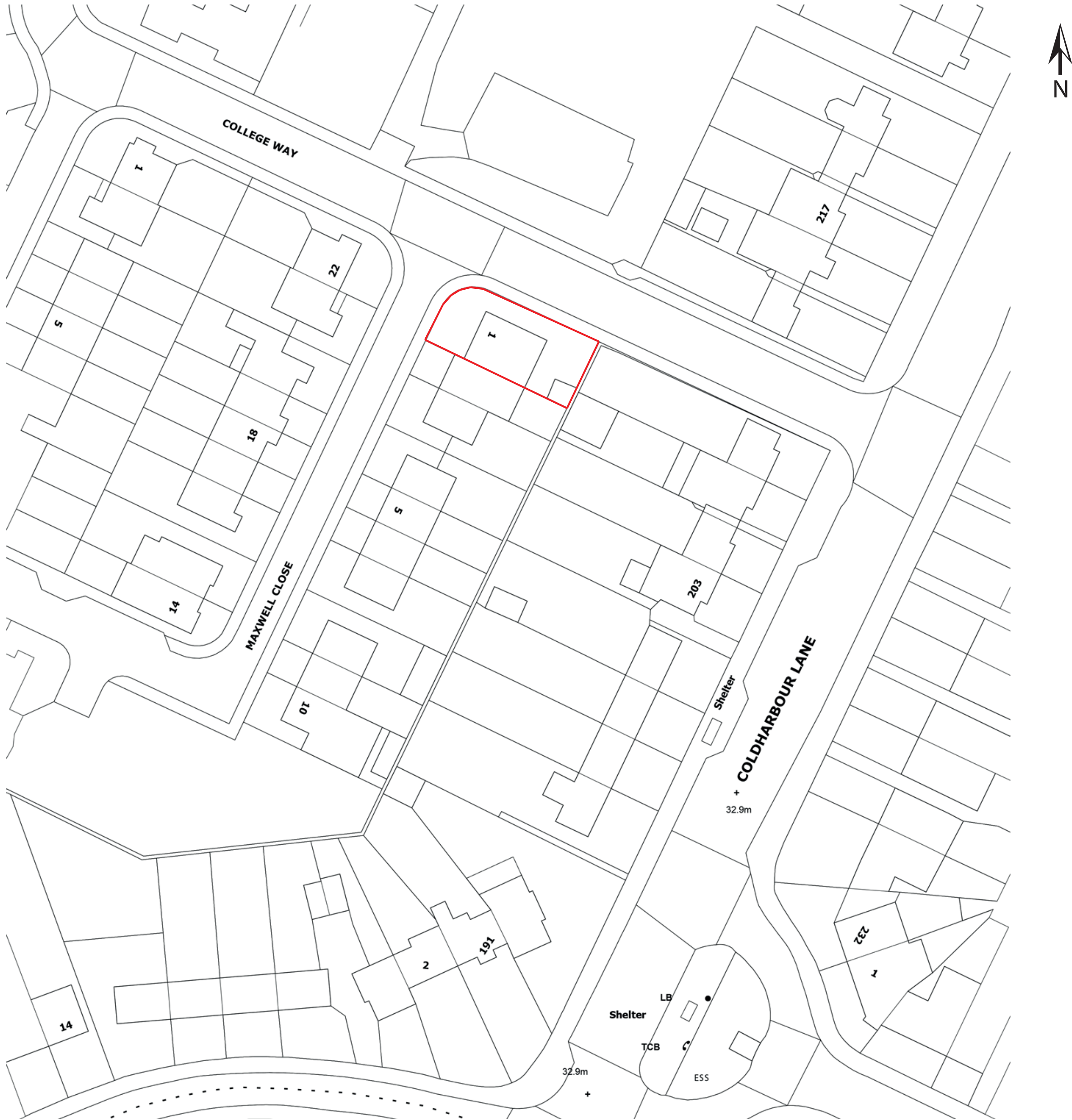
SITE LOCATION PLAN SCALE 1:500 SITE BOUNDRY :