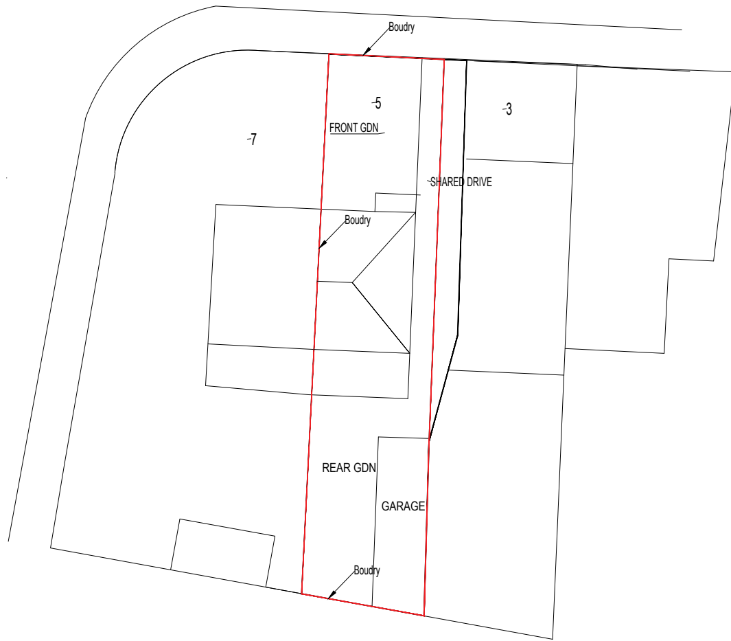
Existing Block Plan (Scale: 1:500)