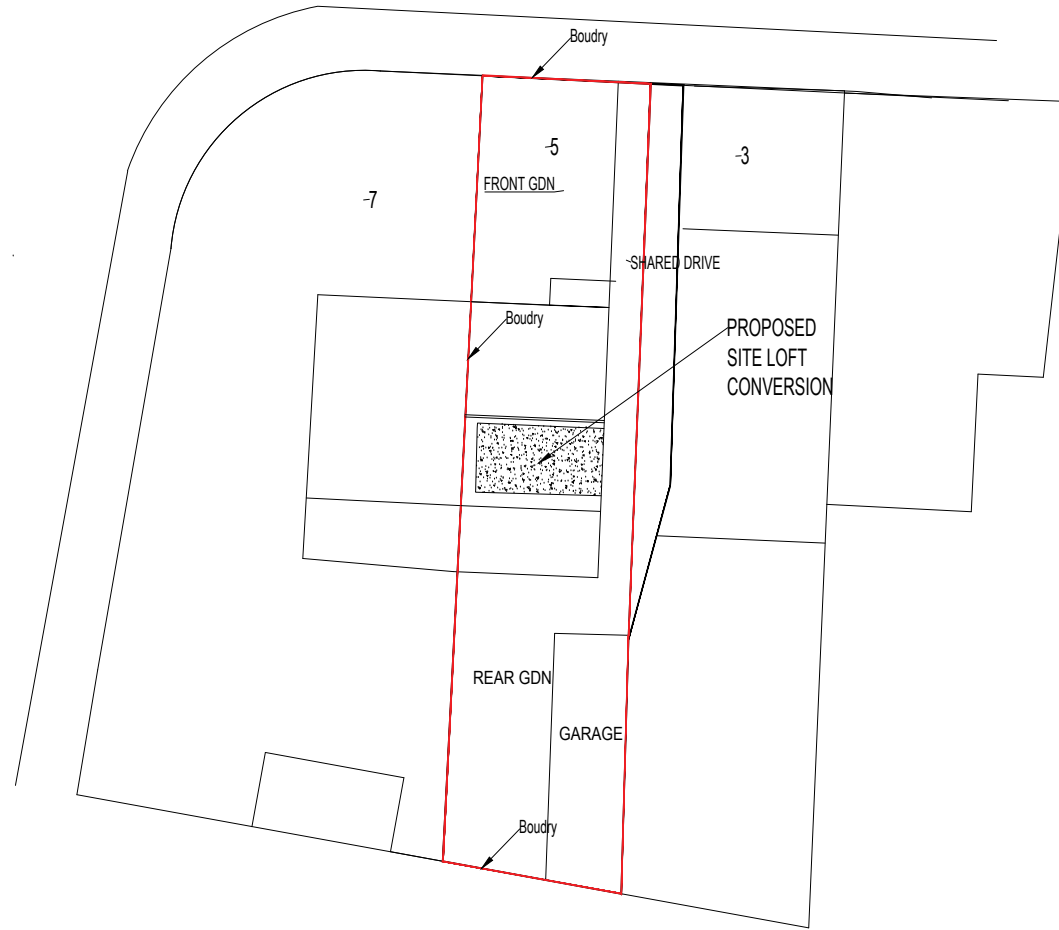
Proposed Block Plan (Scale: 1:500)