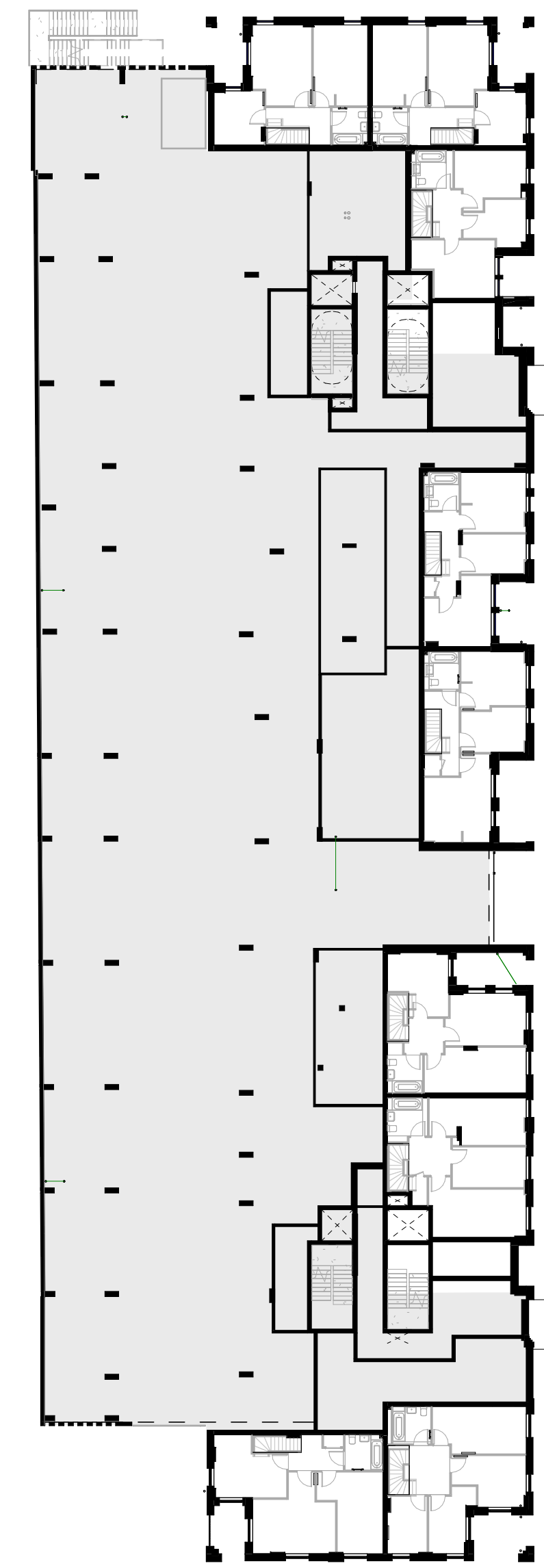
Mezzanine Floor Cycle Stores 1 : 300