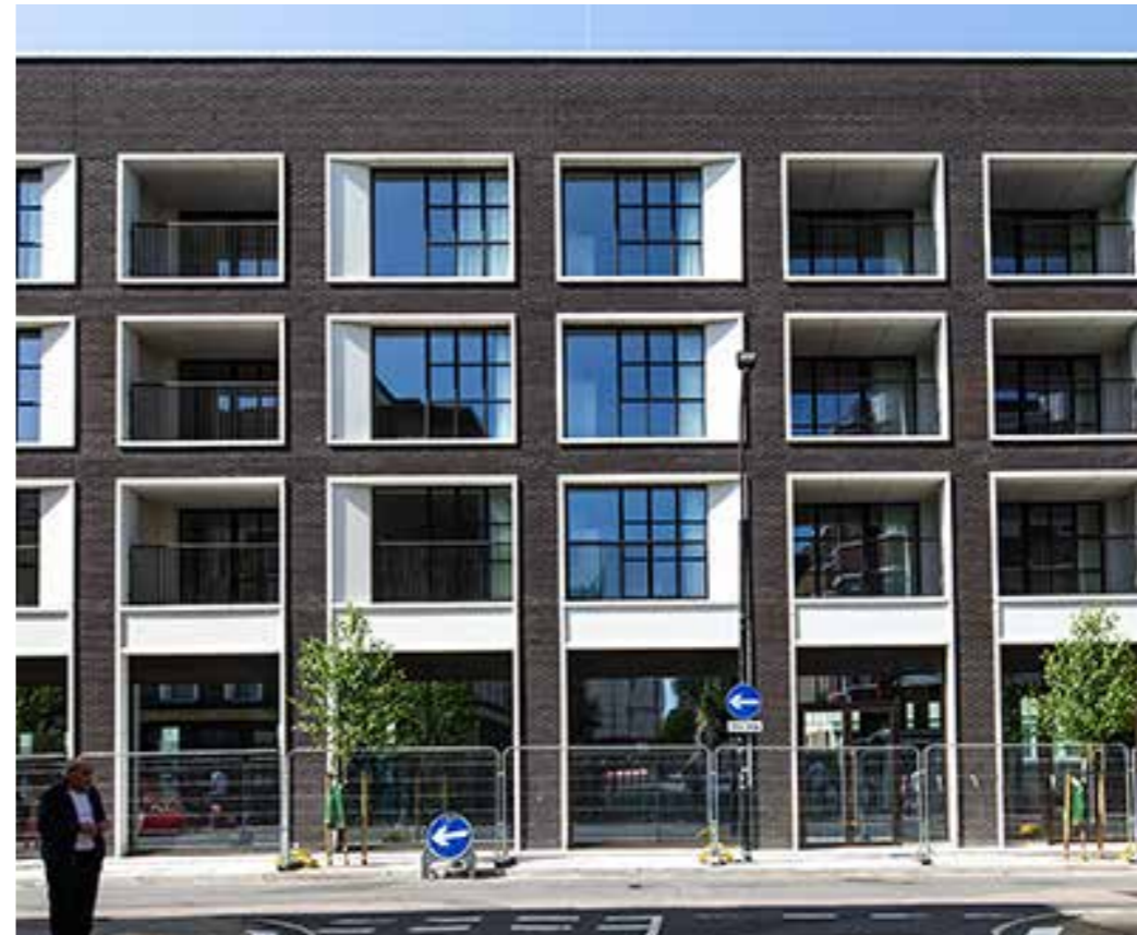
Nearest precedent scheme -

101 on Cleveland - Cleveland Street, London