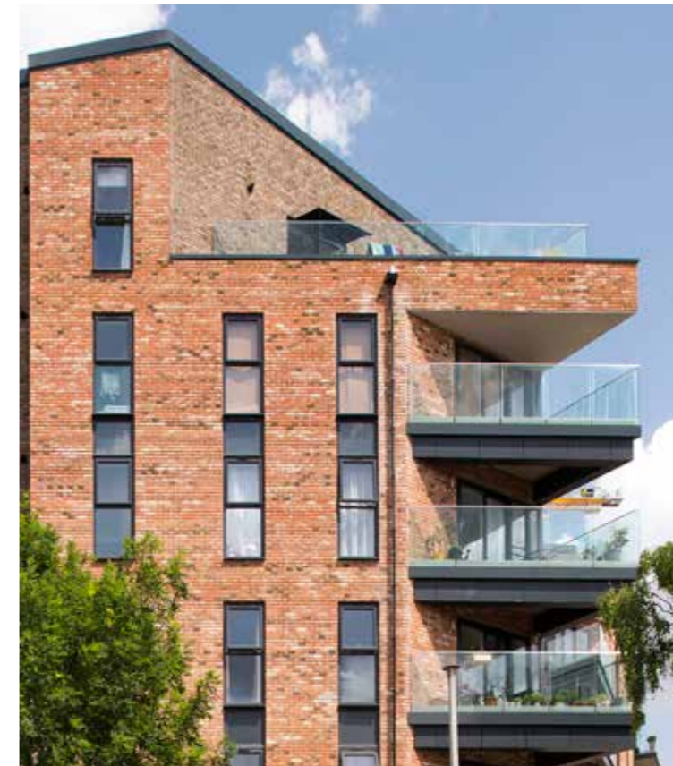
Nearest precedent scheme -