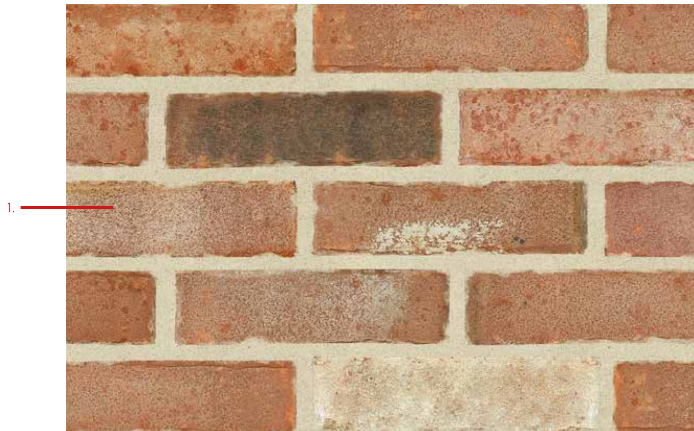
Michelmersh Floren.be 'ALBION'