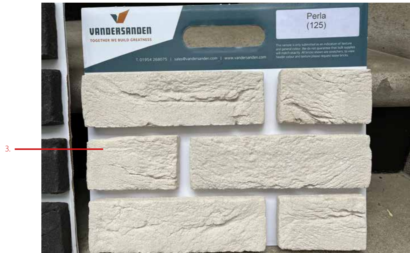
Vandersanden "Perla" White with mortar colour, Dove hole by Cemex