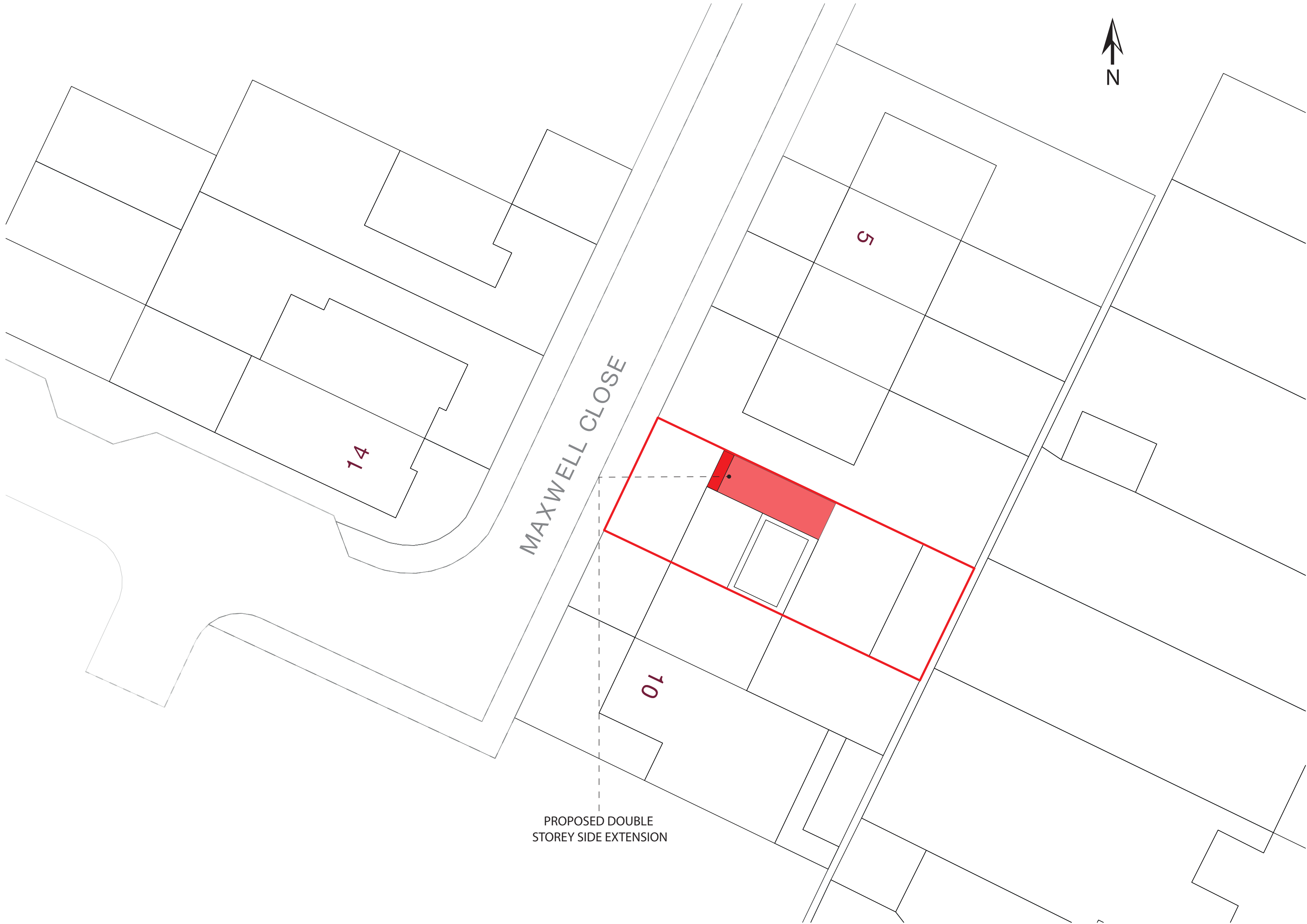
PROPOSED SITE BLOCK PLAN SCALE 1:200 SITE BOUNDARY :