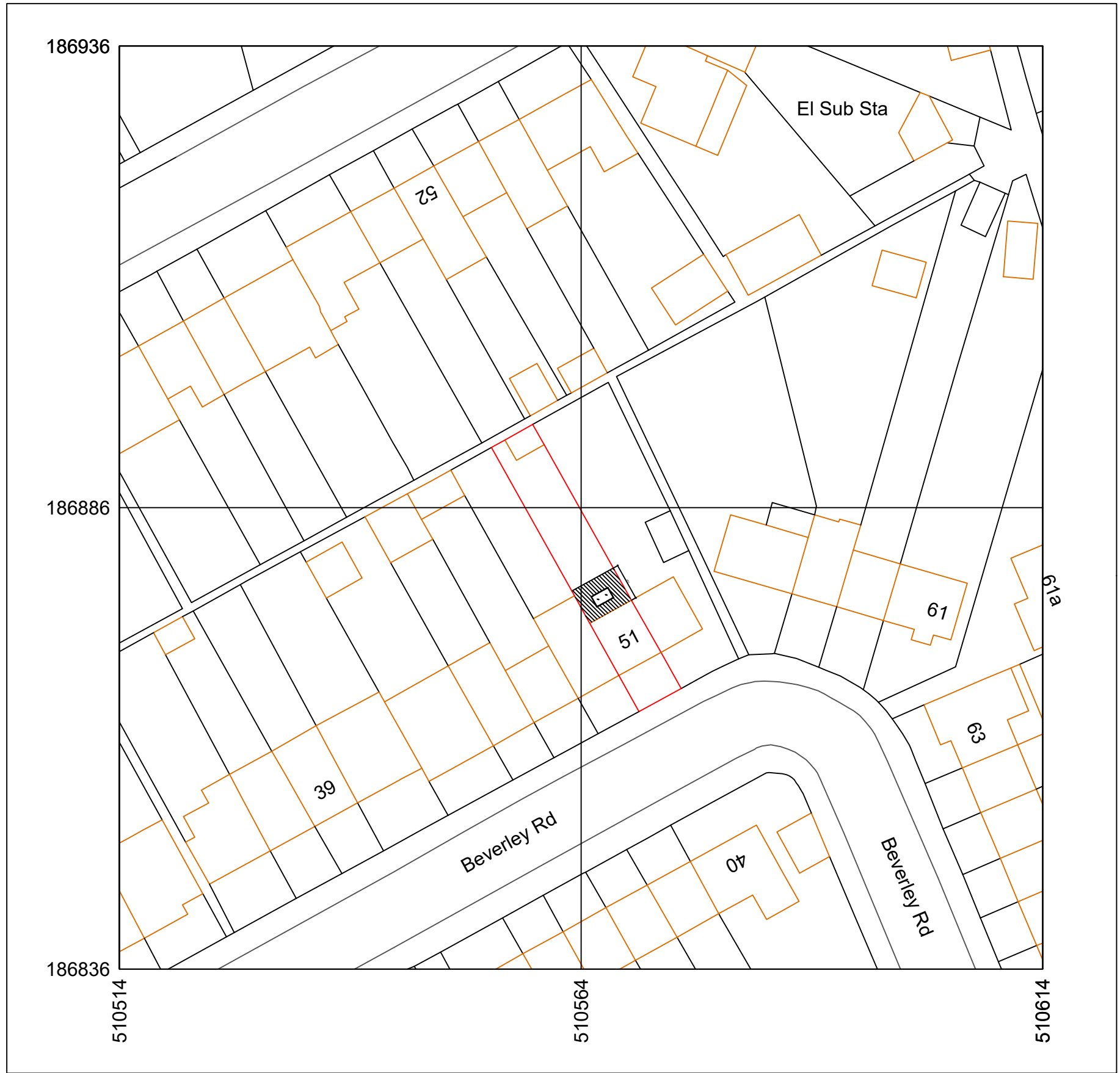
1 BLOCK PLAN Scale: 1:500 @ A3