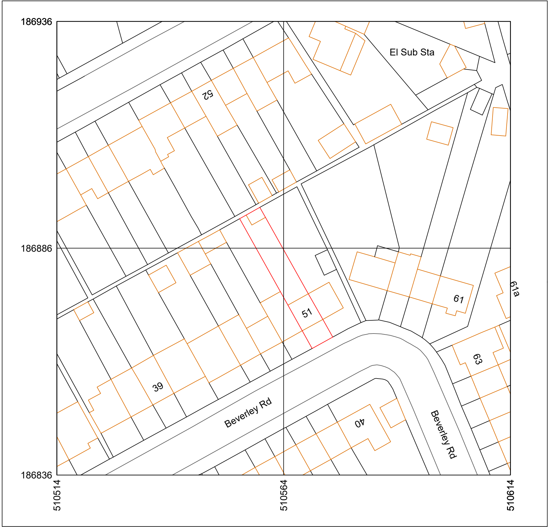
1 BLOCK PLAN Scale: 1:500 @ A3