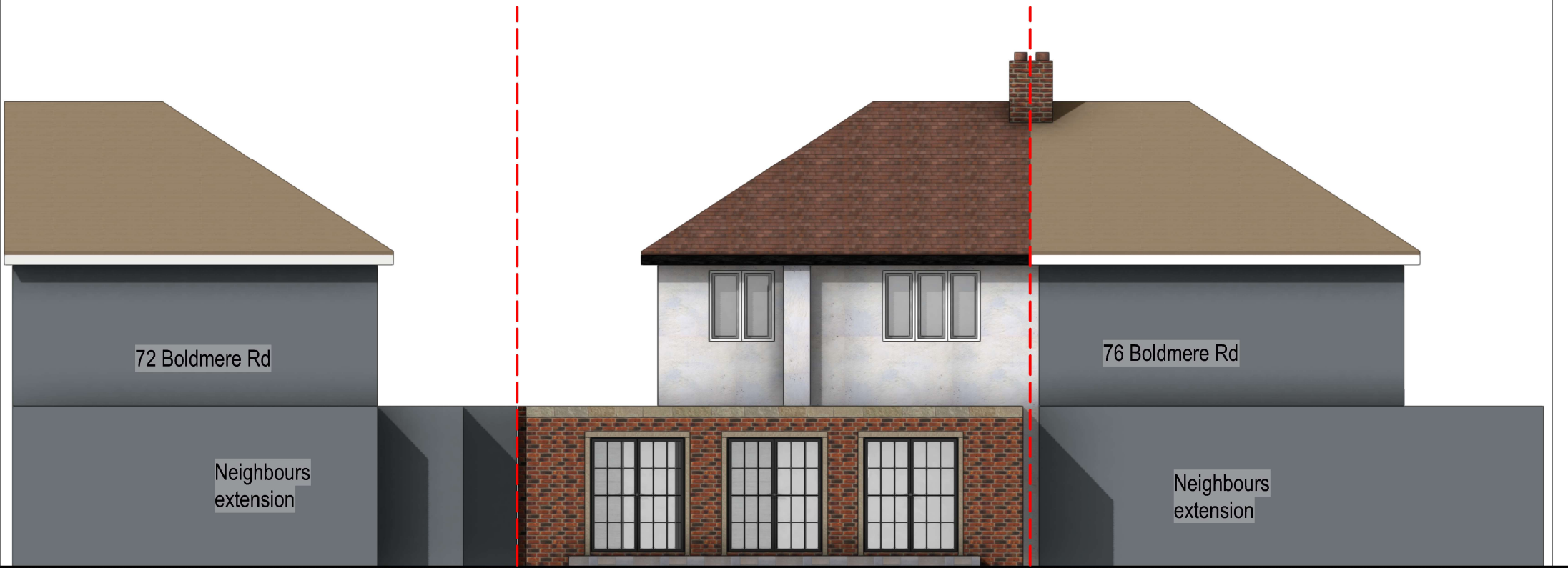
02 02 PROP ELEV REAR Scale: 1:100