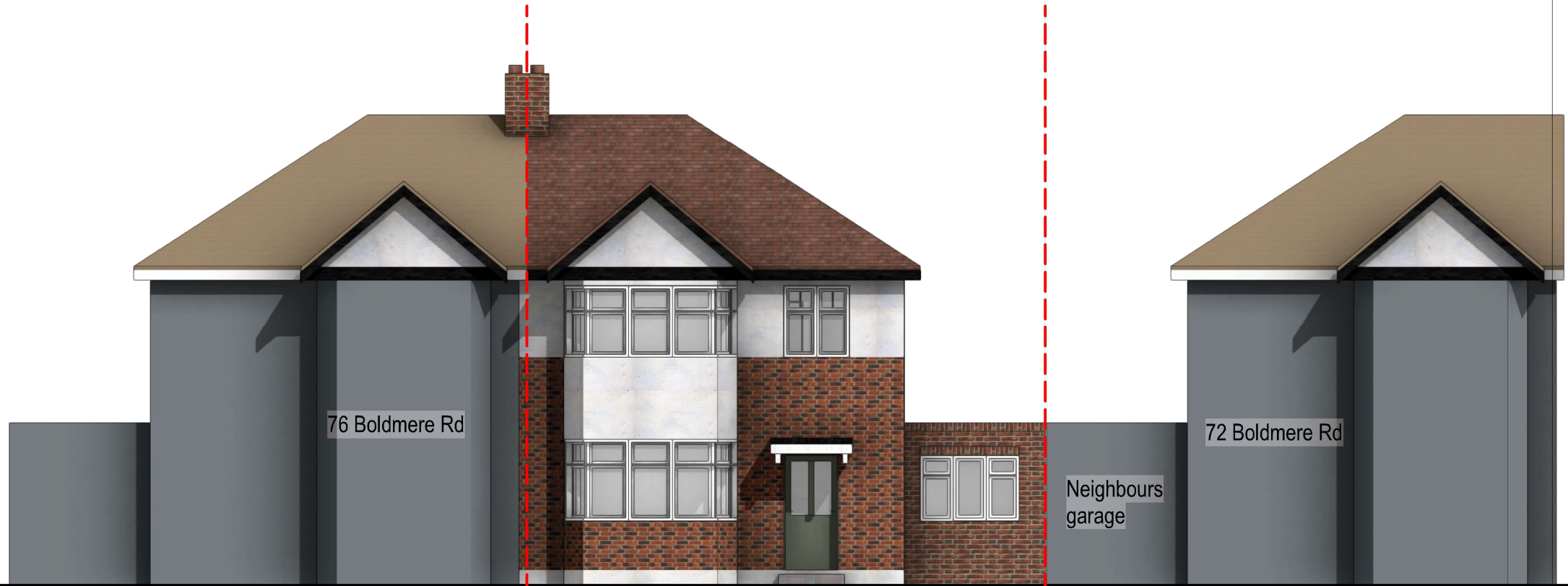
01 01 PROP ELEV FRONT Scale: 1:100