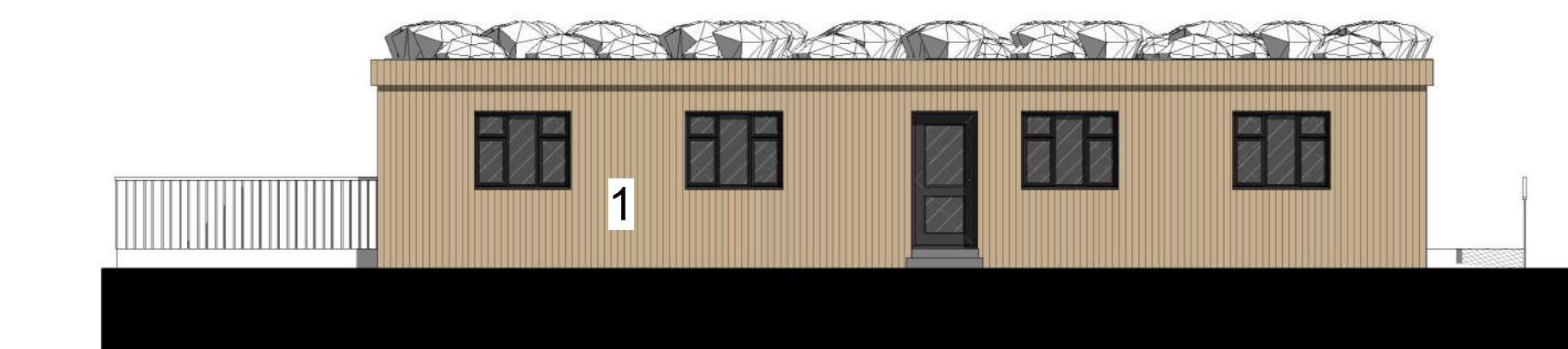
3 West 1 : 100