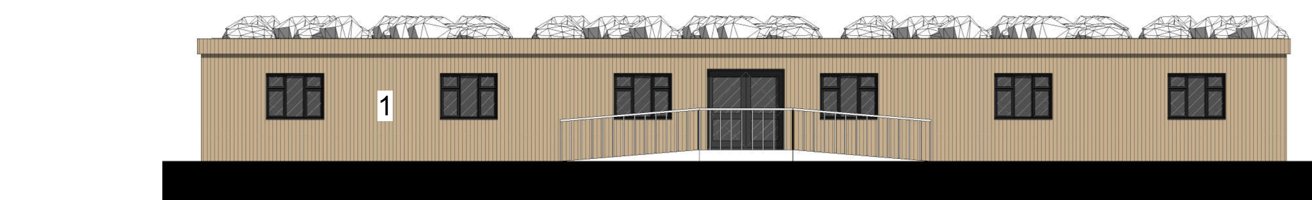
2 South 1 : 100