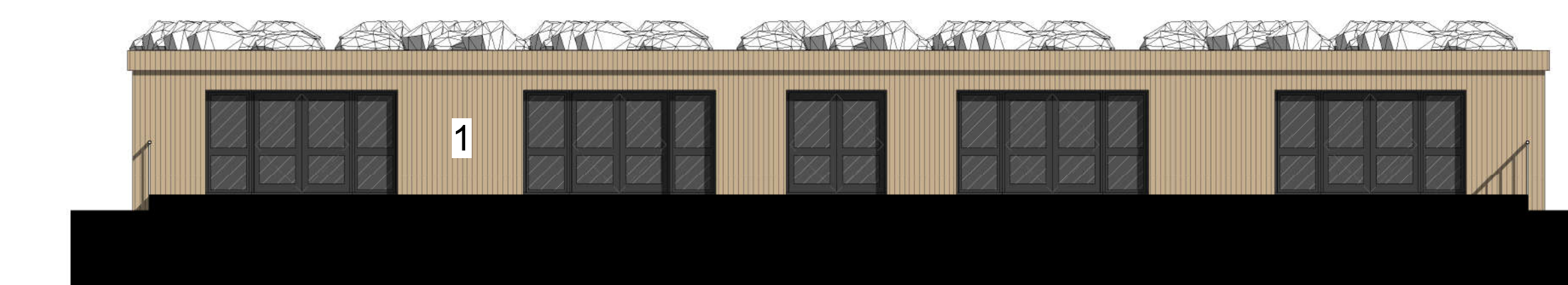
5 North 1 : 100