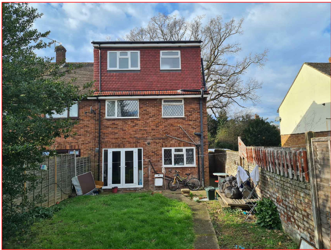
No. 379 REAR ELEVATION