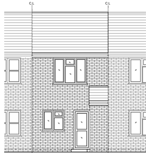
03 - FRONT ELEVATION