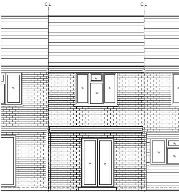
04 - REAR ELEVATION