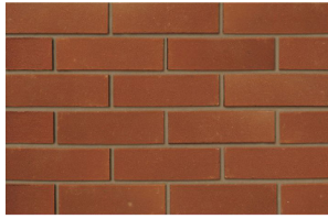
Red Wienerberger Sienna Brick to finish external elevations Width: 215mm Height: 65mm Depth: 102.5mm