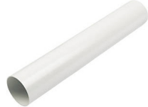
White drainpipes to be used on side & rear elevations