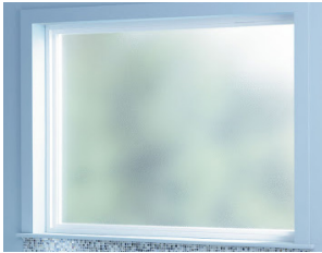
UPVC white frame obscure glass window