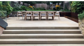
White natural stone clad steps