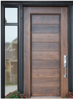
Main entrance door