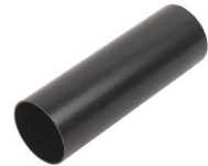
Black drainpipes to be used at the front of the house