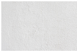
White render to finish external elevations