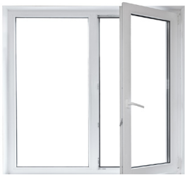
UPVC white frame window