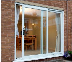
White Frame Sliding Door