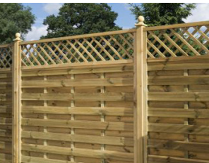
Walnut wooden fence