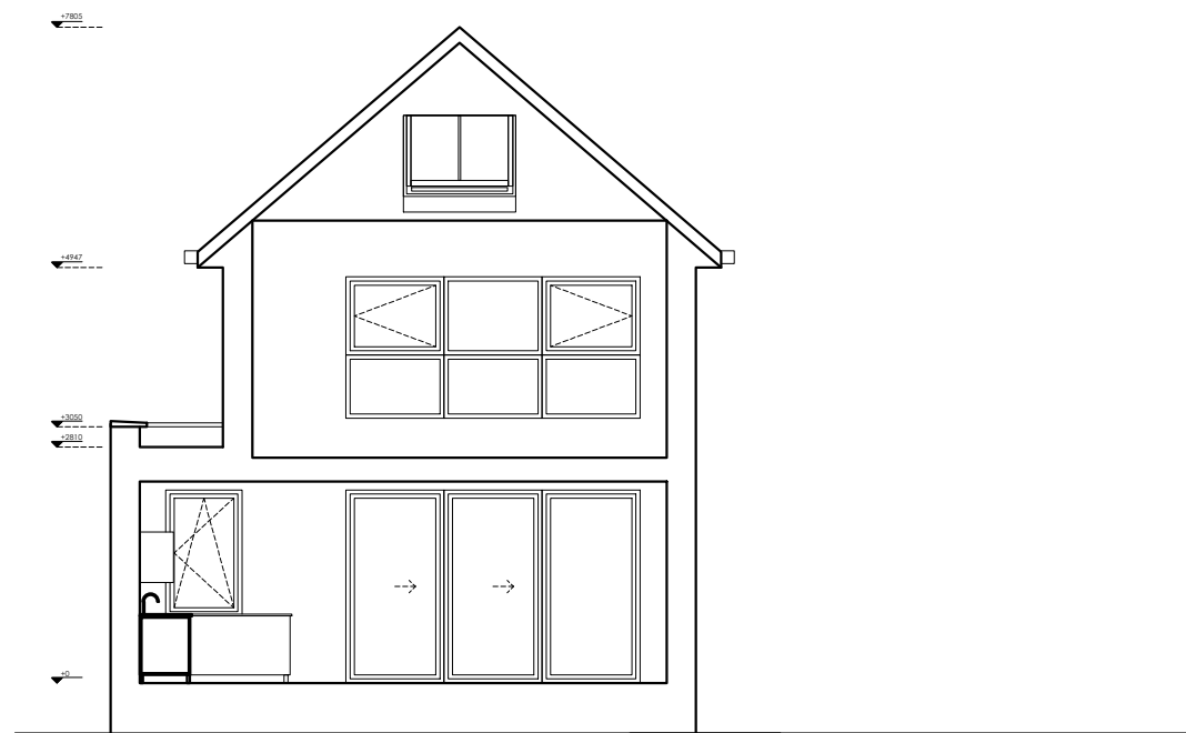
APPROVED AFTER APPEAL 73080/APP/2018/2707 SECTION