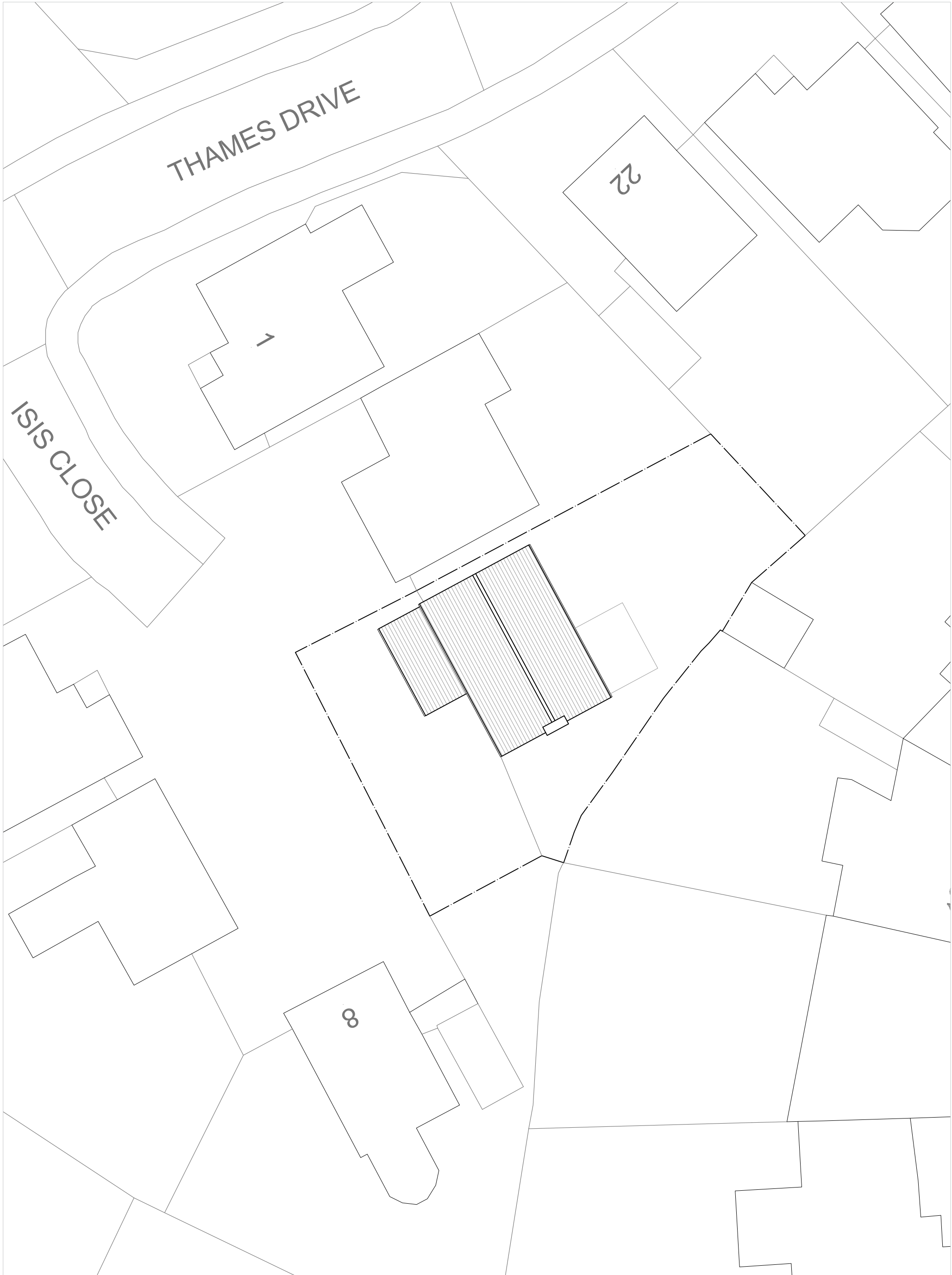
EXISTING SITE PLAN SCALE 1:200