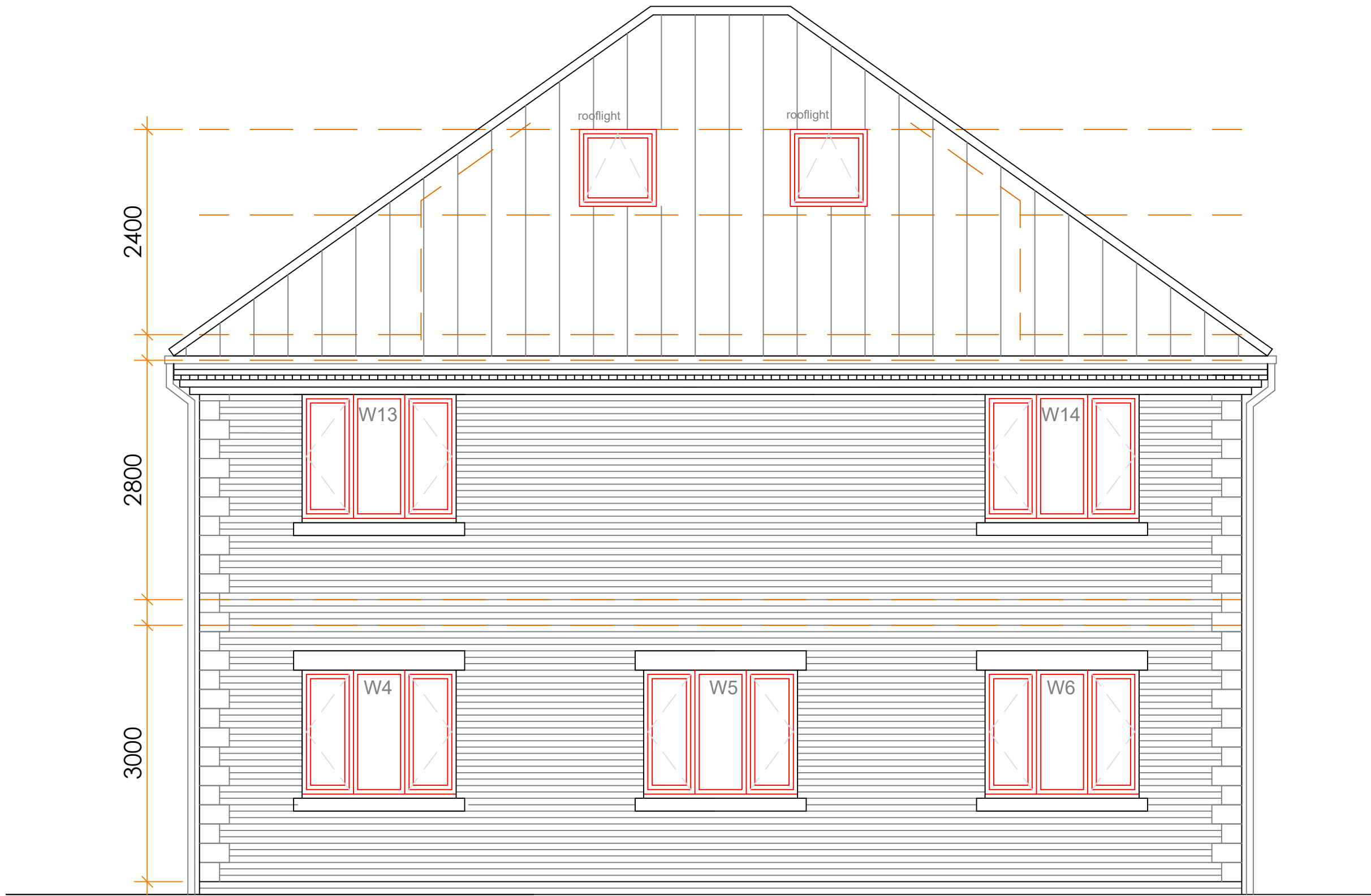
PROPOSED REAR ELEVATION (SOUTH)