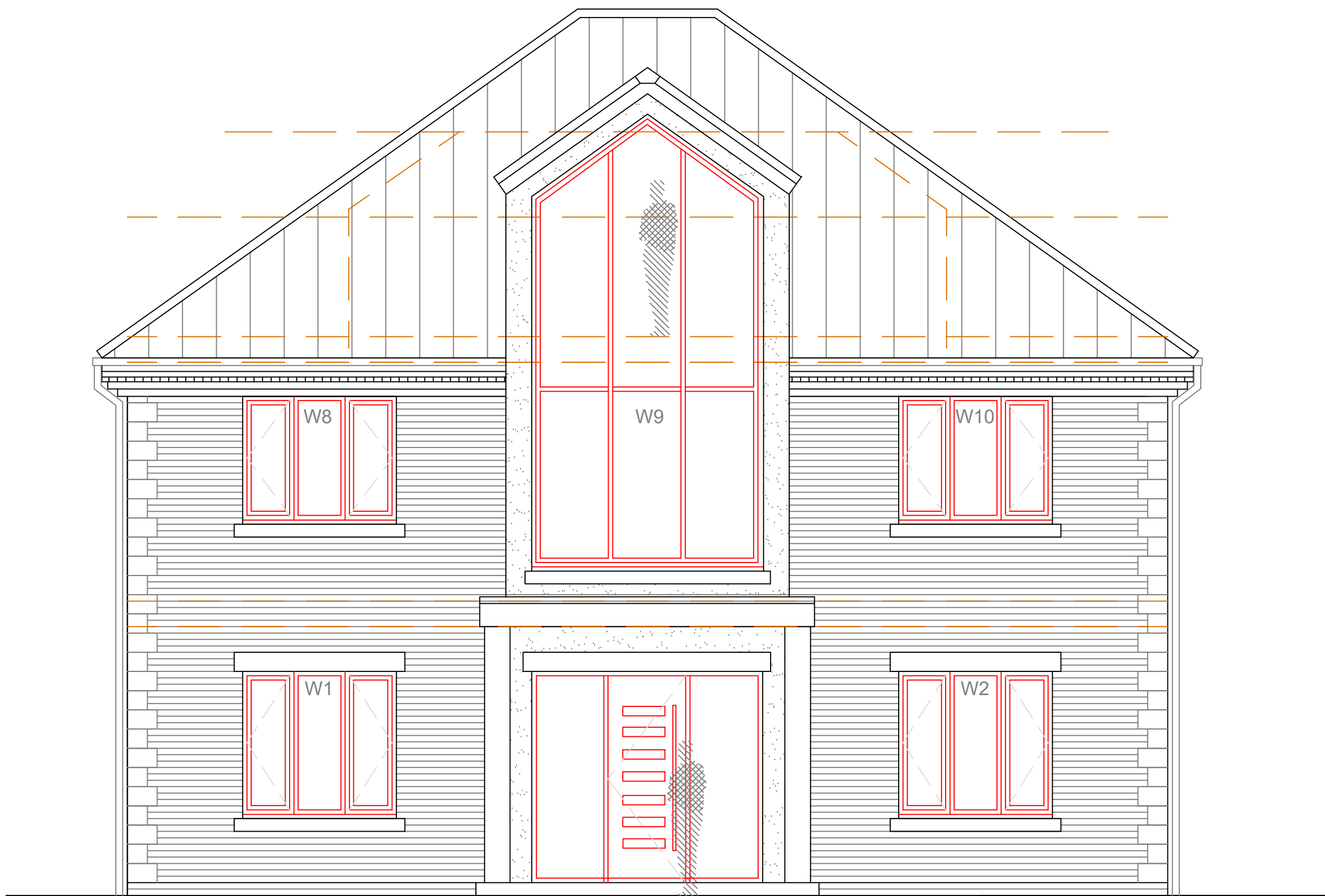
PROPOSED FRONT ELEVATION (NORTH)

Materials: ROOF: Marley Eternit Rivendale blue/black slate with matching ridge and hip details. RWG: Square profile gutter and matching square profile downpipes in black aluminium DENTIL: GRP dentil profile by specialist in off-white to match Portland coloured cill and quoin BRICK: Crest Titan multi-grey 65mm textured brick RENDER: Finish to portico and feature dormer at front; self coloured acrylic render to match Portland finish elsewhere HEADS/CILL/QUOIN: Portland coloured cast stone WINDOWS: Aluminium d.g casement windows in RAL7038 Agate grey. Feature window over entrance to be fixed aluminium d.g window by specialist RAL7038 Agate grey DOORS: Front door RAL9005 black aluminium with laminated d/g side screens. Side doorset RAL7038 Agate grey aluminium with vp. Both to PAS24 security. PATIO DOORS: 5 panel (3+2) in-folding aluminium patio door set in RAL7038 Agate grey GUTTERS +DOWNPIPES: Square pattern aluminium in RAL9005 Black