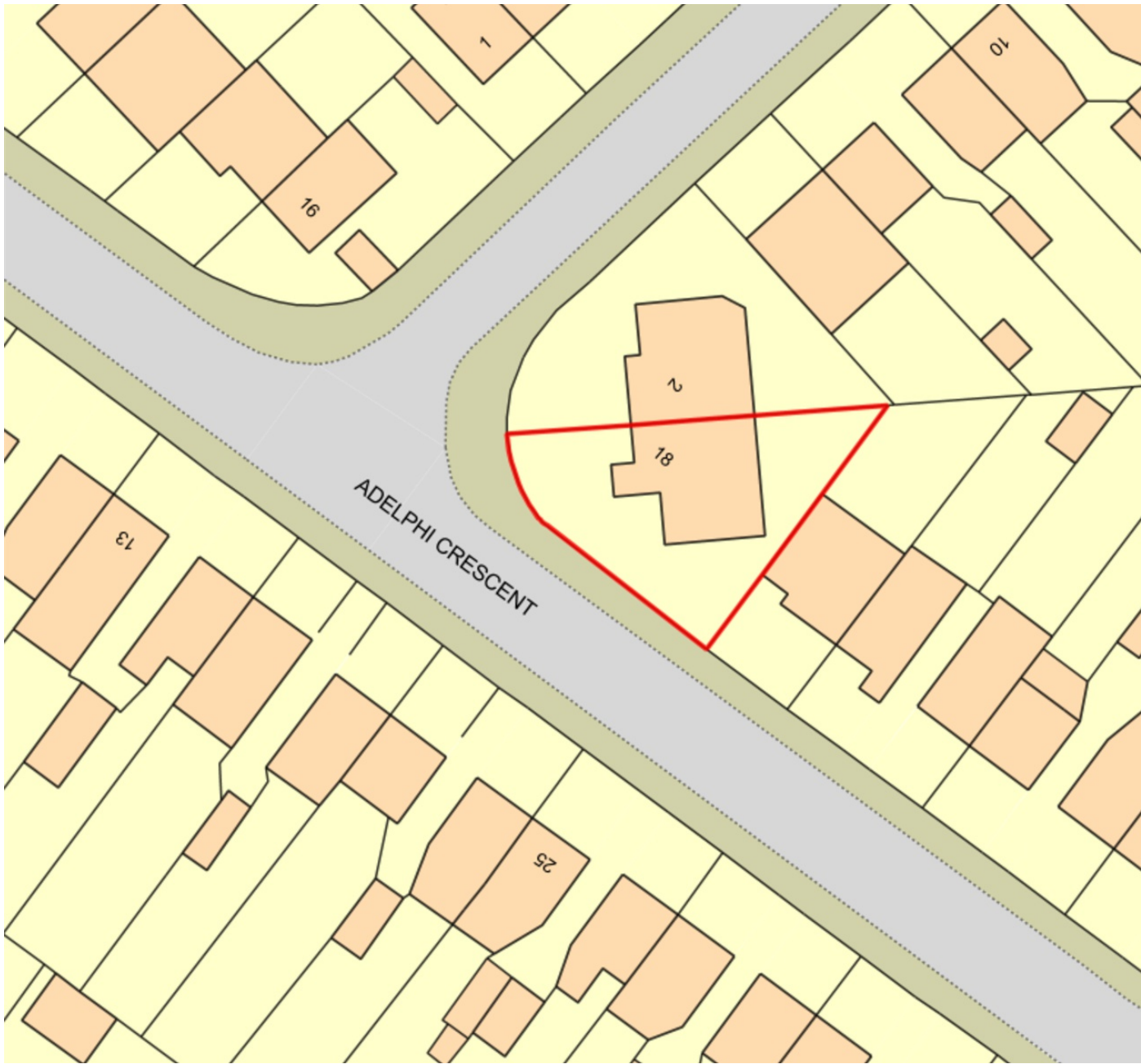
Existing Block Plan (Scale: 1:500)