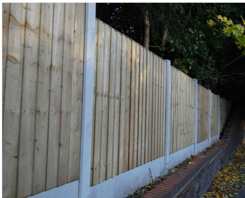
Fence Panels – Timber panels Fence Posts – Slotted Fence Posts & Gravel Boards