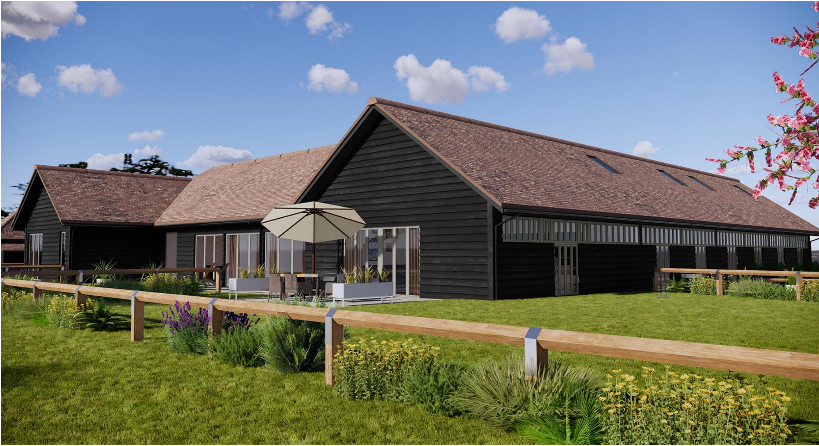
View of building from existing Menage

Notes This document and its design content is copyright ©. It shall be read in conjunction with all other associated project information including models, specifications, schedules and related consultants documents. Do not scale from documents. All dimensions to be checked on site. Immediately report any discrepancies, errors or omissions on this document to the Originator. If in doubt ASK. ####