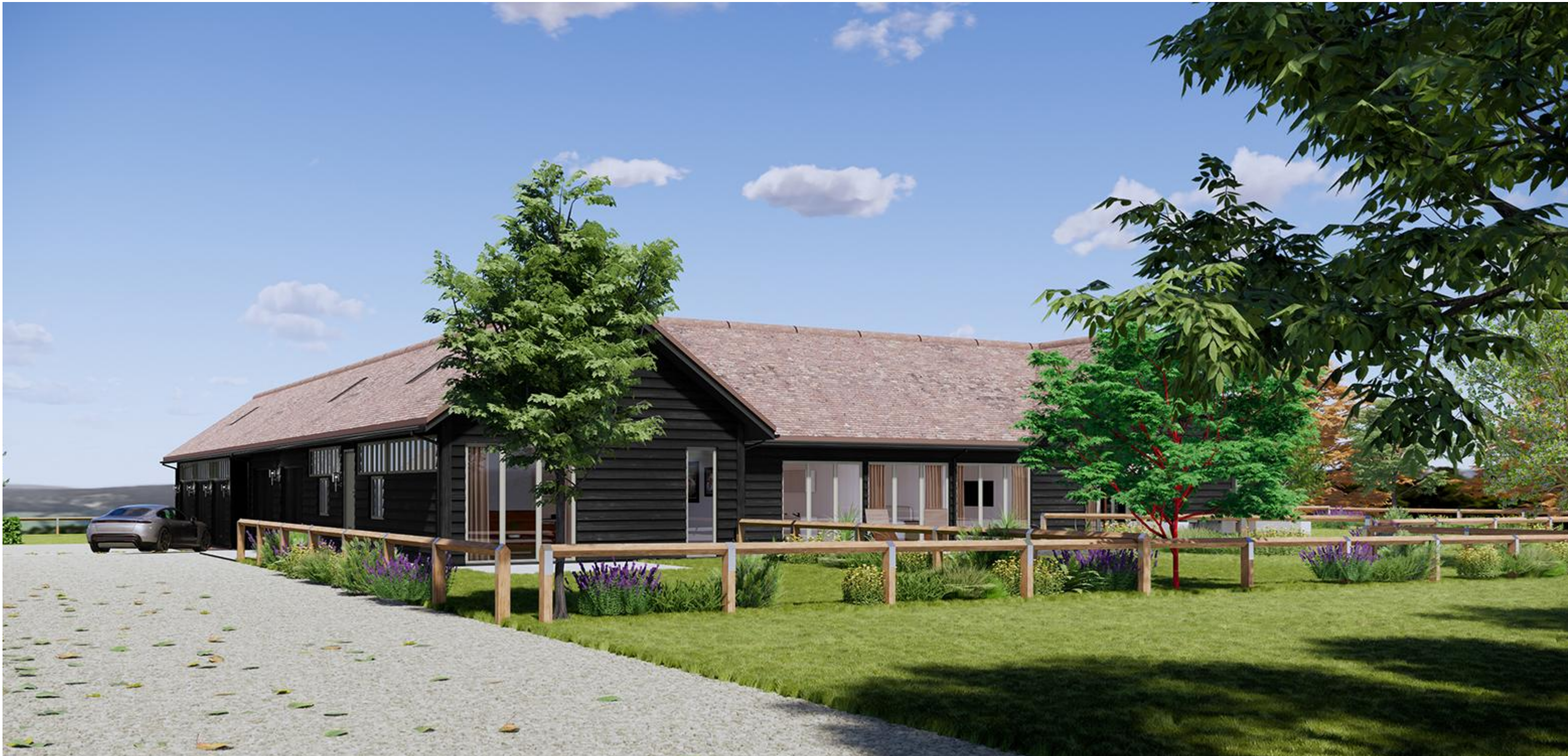
View of the building as accessing the site