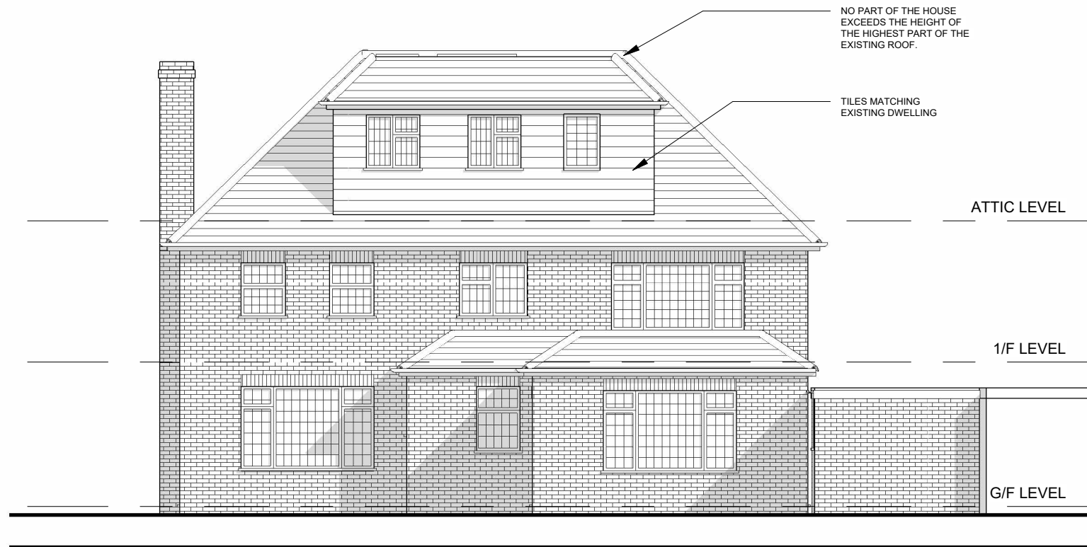
1 PROPOSED NORTH EAST ELEVATION