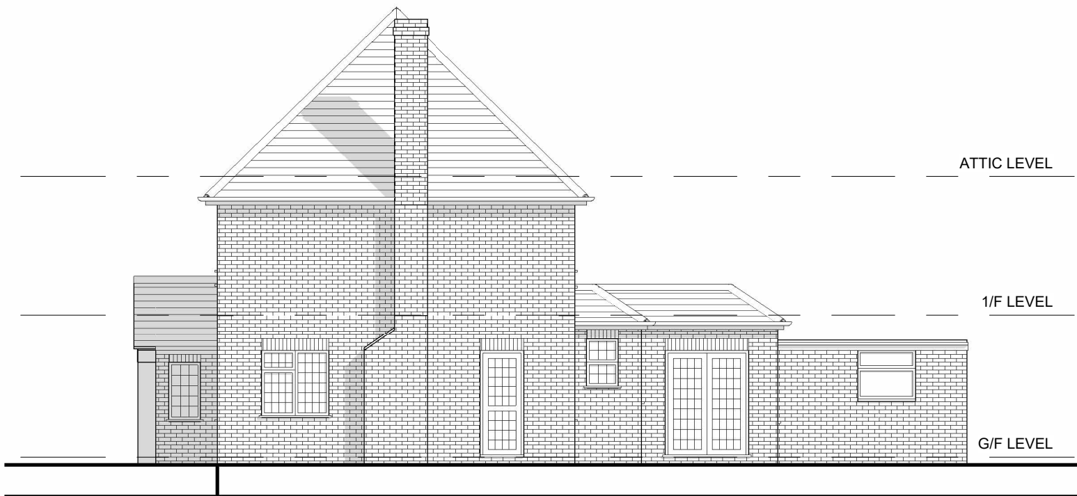
2 EXISTING SOUTH EAST ELEVATION