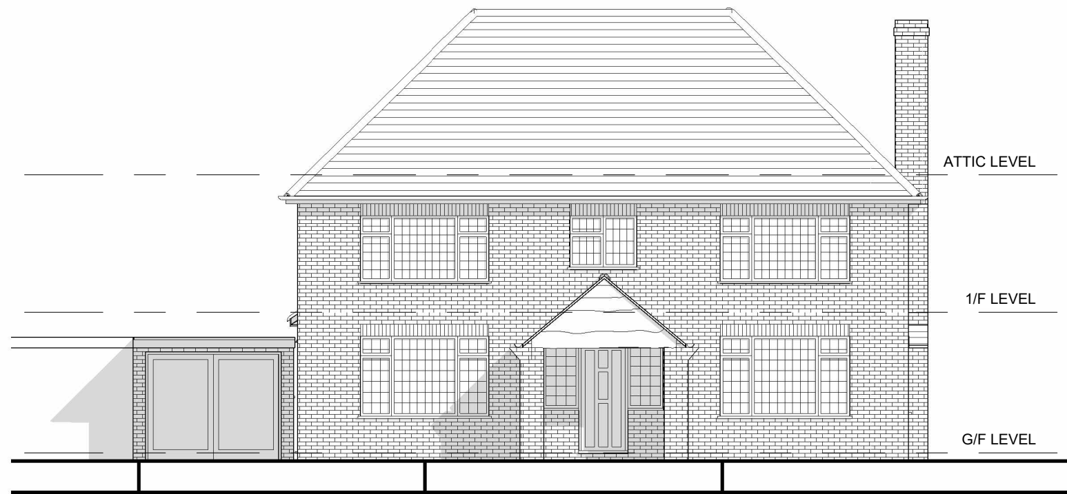
1 EXISTING SOUTH WEST ELEVATION