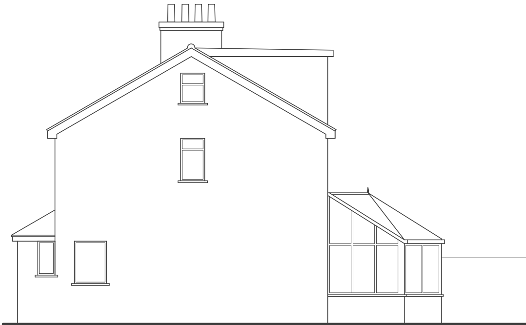
Side Elevation, Existing