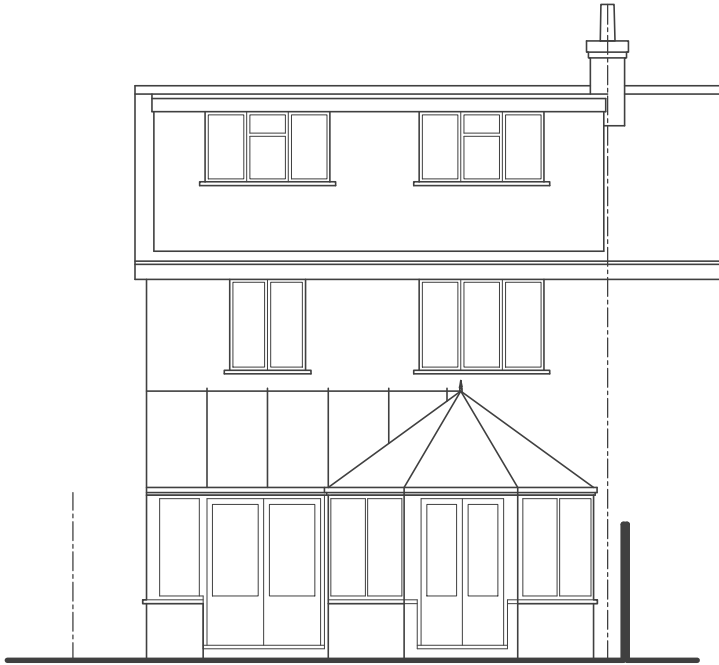
Rear Elevation, Existing