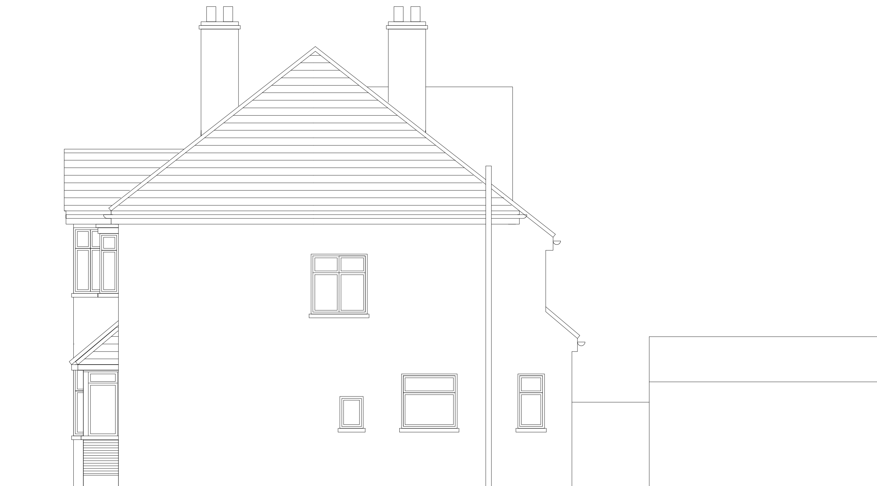
03 SOUTH WEST ELEVATION (flank facing) SCALE: 1:50 @ A1