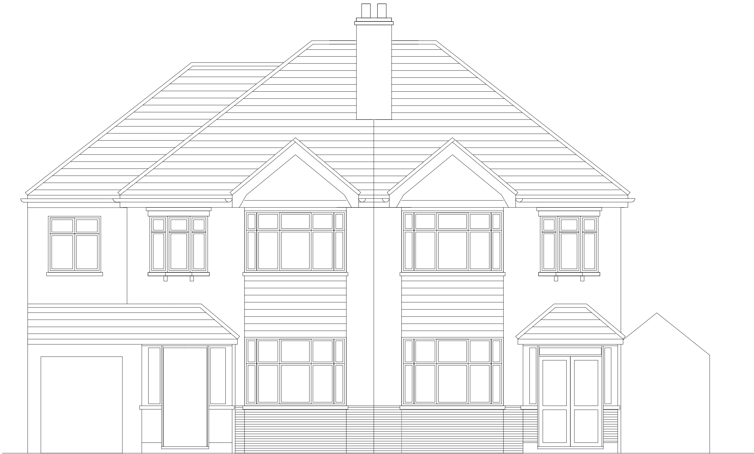
01 NORTH WEST ELEVATION (street facing) SCALE: 1:50 @ A1