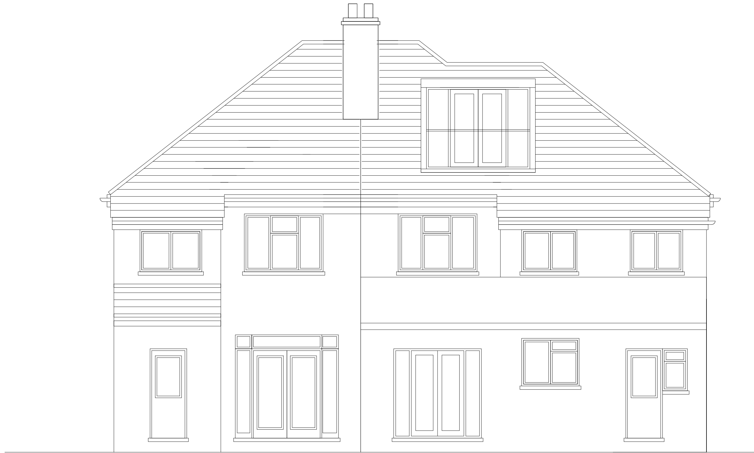
02 SOUTH EAST ELEVATION (garden facing) SCALE: 1:50 @ A1