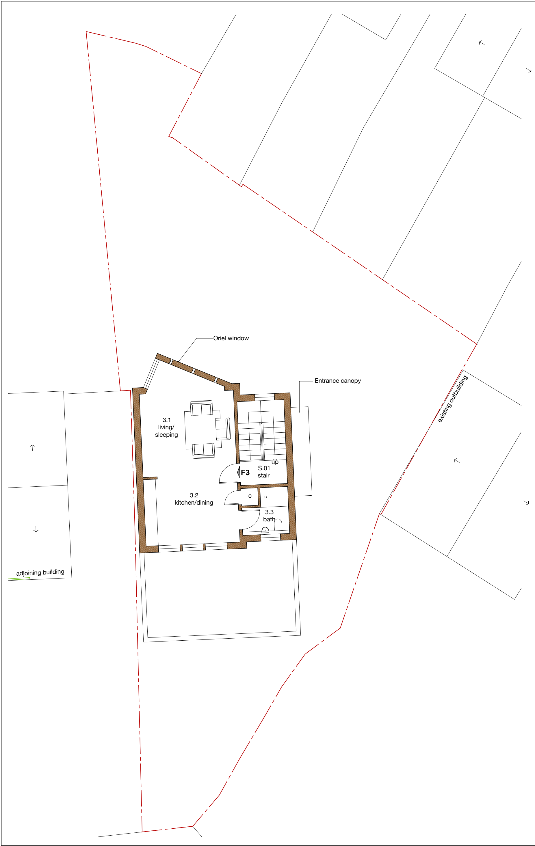
PROPOSED SECOND 1:100 GIFA 38m 2 (Studio)