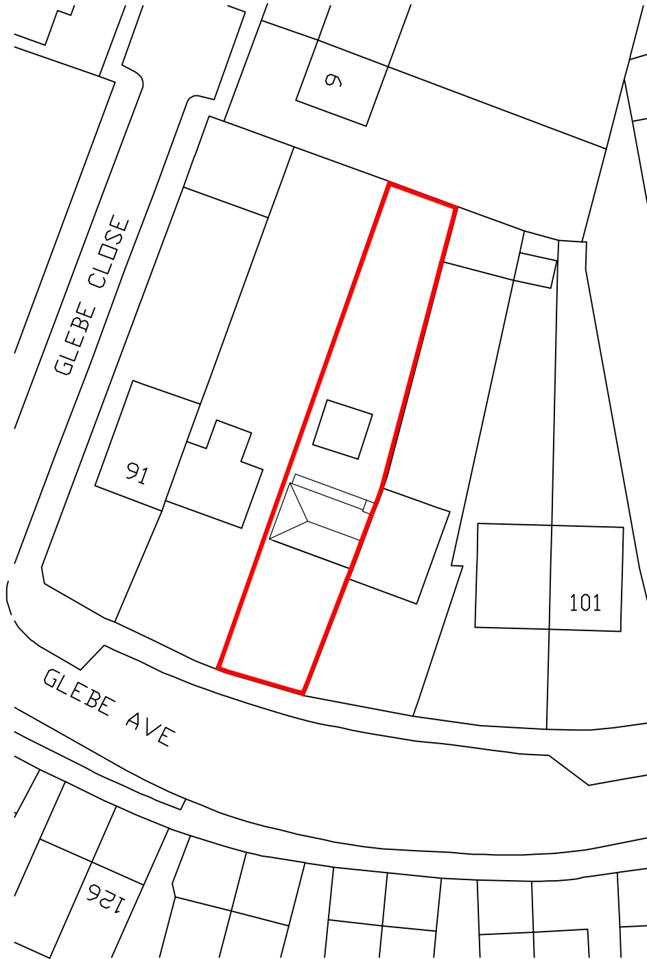
Existing Block Plan 1:500