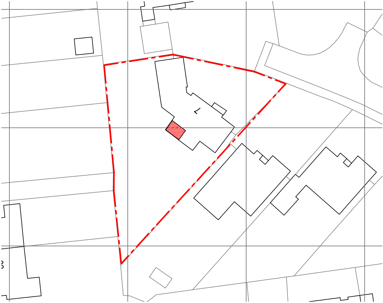
site plan 1:500

© This drawing is the copyright of Mill Lane Design and may not be reproduced or amended without written permission. No liability will be accepted for amendments made by other persons. The contractor is to check and verify all dimensions and levels prior to work commencing. The contractor is to comply with all current Building Legislation whether or not specifically stated on this drawing. This drawing must be read with and checked against all relevant Engineers and Architects drawings and all other specialist information provided. Sketch proposals are for illustrative purposes only and as such are subject to detailed site investigation. Sketch proposals may be based on enlargements of OS Sheets and estimations of existing site features and will therefore need to be verified by survey. Do not scale. Only figured dimensions to be worked to. Any discrepancies are to be reported to Mill Lane Design