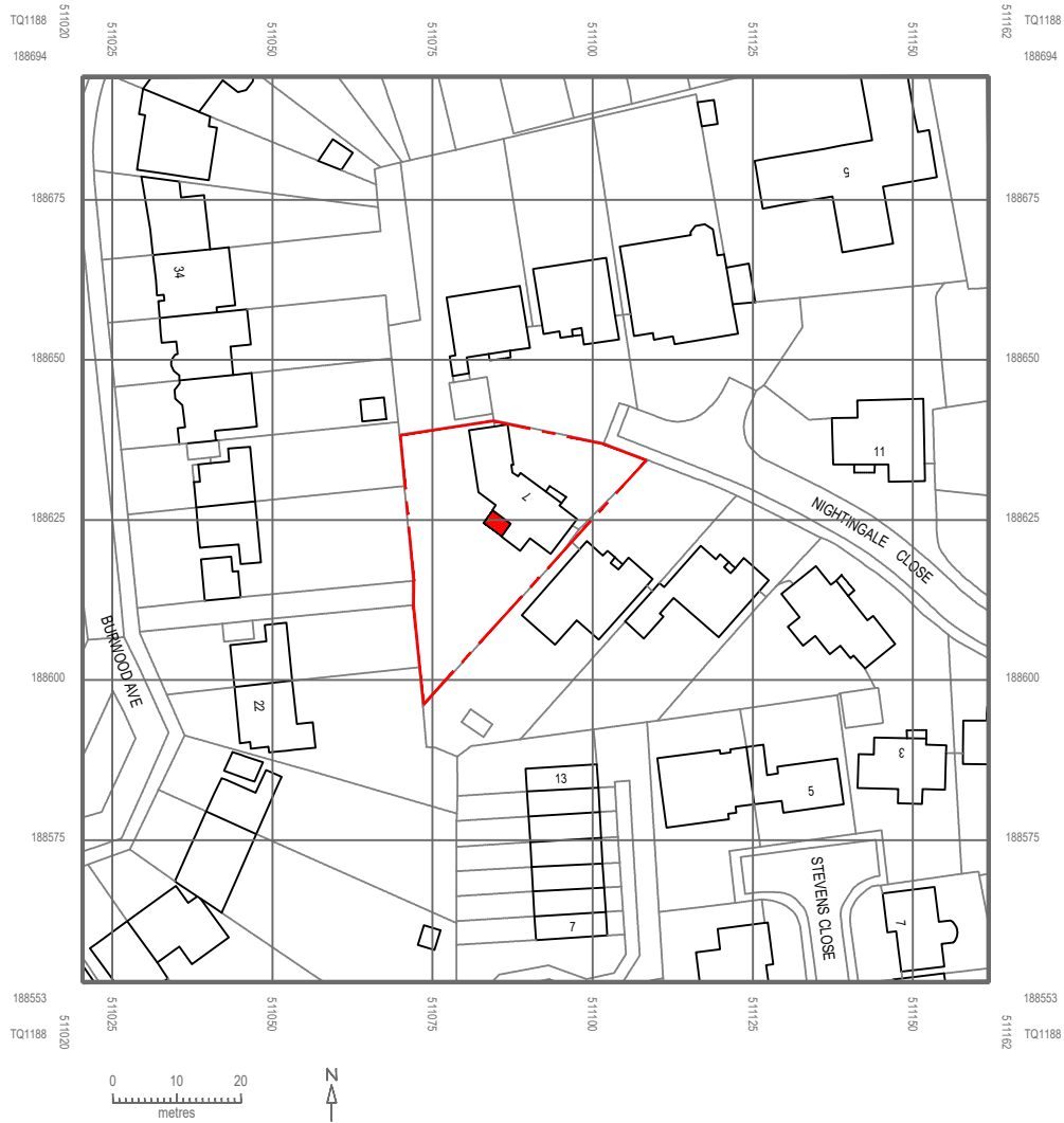
location plan 1:1250