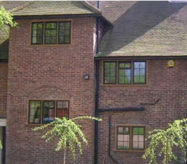
TYPICAL WINDOW TO FIRST FLOOR

EXTERNAL DOORS AND WINDOWS SMART SYSTEMS ALITHERM HERITAGE 47 RANGE BY THE HERITAGE WINDOW COMPANY www.theheritagewindow company.co.uk OR EQUAL APPROVED. UNITS 19-21,23 FIRST FLOOR ONLY IN RAL 9010 (WHITE) UNIT 17 - ALL WINDOWS IN RAL 7021 (BLACK GREY)