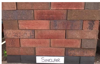
Photo of bricks in yard