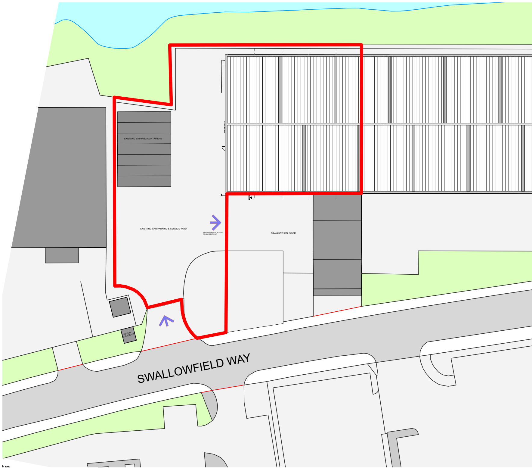
1 EXISTING SITE PLAN Scale: 1:500