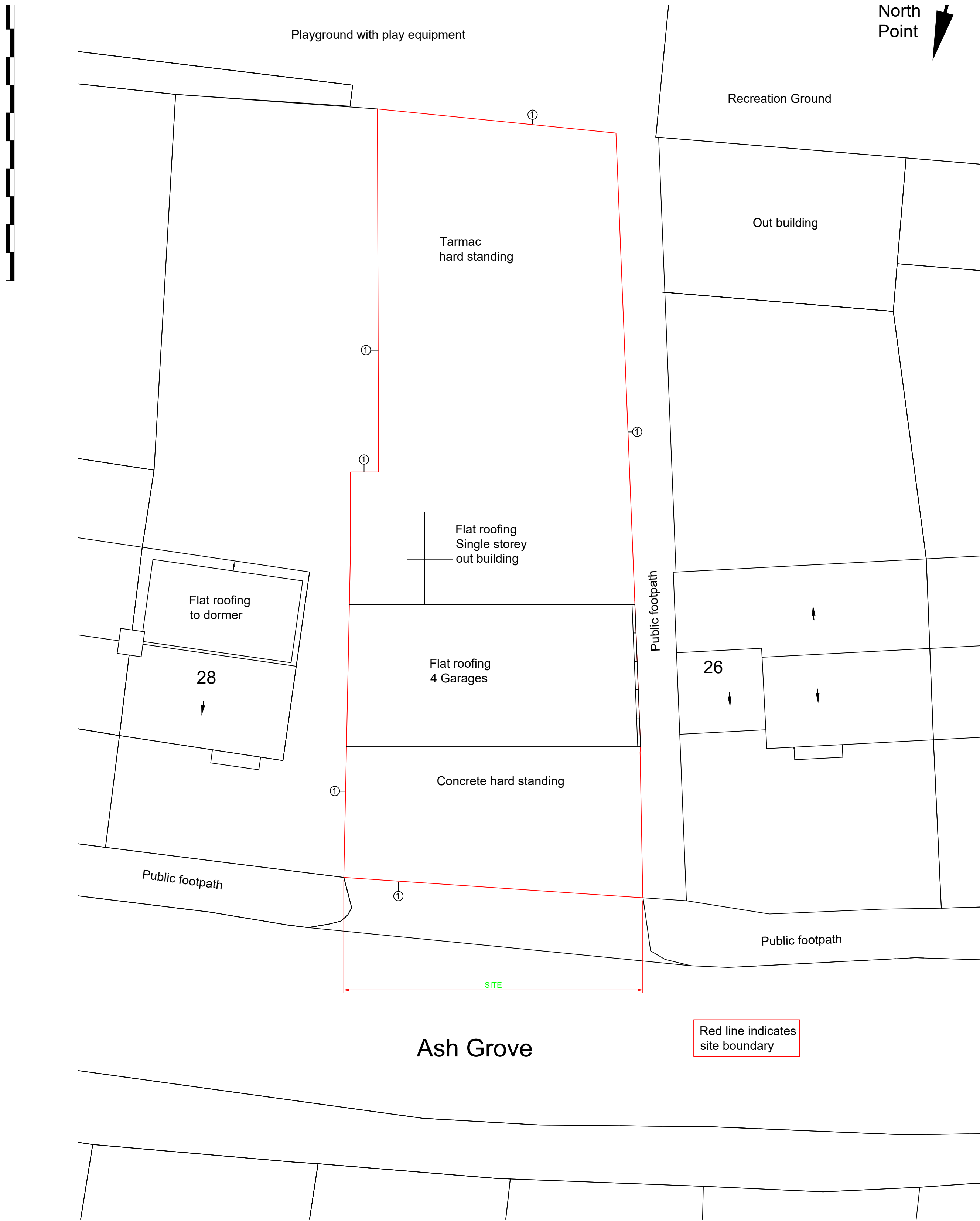
Existing Site Block Plan Scale 1:100